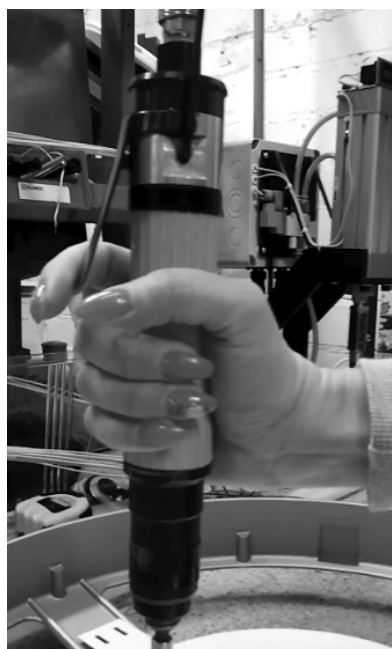
Figure 2. Pneumatic screwdriver