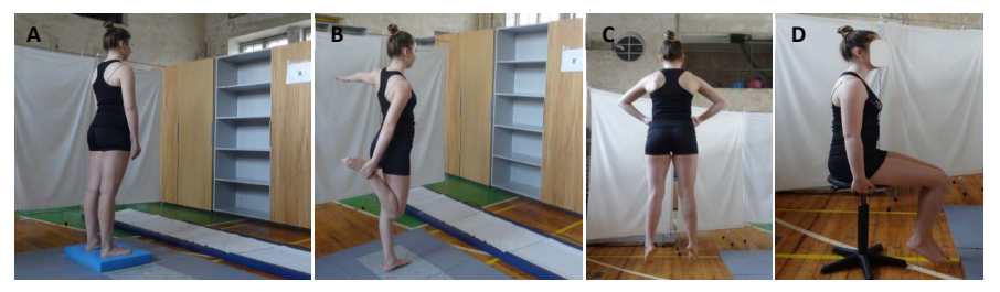
Figure 1. The standing on "foam" (A); Flamingo test standing on right and left legs (B); Jumping test performance (C); Spinning around test performance (D).

The participants' static body balance was measured at the beginning (in the autumn) and at the end (in the spring) of the eight-month dancing period. The purpose of the study and procedures were explained to the subjects and all questions were answered. After a light warm-up the subjects' body height and weight were measured. The static balance testing was performed on the dynamographic force platform Kistler 9286A (Switzerland) during 30- second bipedal standing on stable and unstable "foam" (Alcan Airex AG, Switzerland, 50x41cm) support surface with eyes open (EO) and eyes closed (EC) (Figure 1, A). Next were performed the Flamingo test (Figure 1, B), jumping test (induction of fatigue) consisting of 16 repetitive Sauté jumps (Figure 1, C) and 10-time spinning around test (vestibular stimulation) in the sitting position (Figure 1, D).