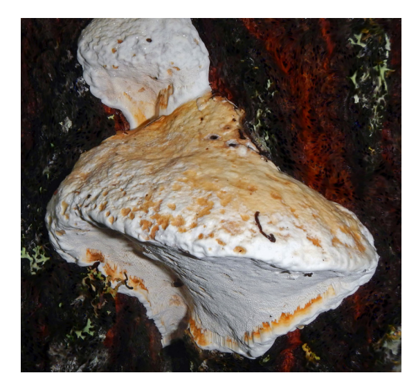
Fig. 2. Haploporus odorus on living Salix sp. in spruce forest (INEP 1452).

SKELETOCUTIS LILACINA A. David & Jean Keller – Murmansk Region, Kandalaksha District, neighborhood of Kanda River, 67°6'11.27"N, 31°50'36.29"E, in spruce forest, on fallen trunk of Picea obovata 24.07.2015, coll. and det. YK (INEP 1450) (Fig. 3).