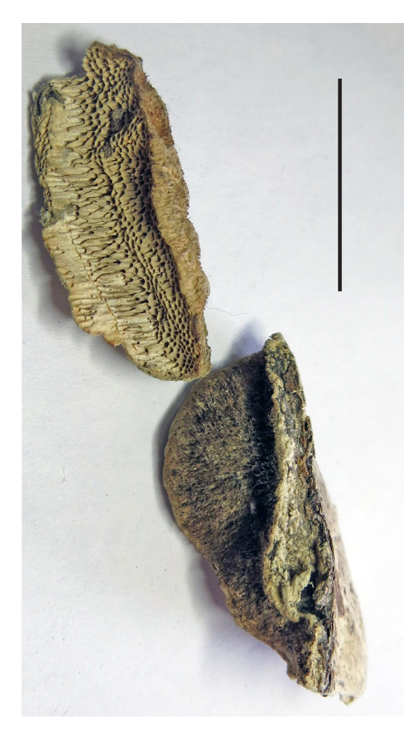
Fig. 4. Trametes trogii on stump of Populus tremula (INEP 1451). Scale bar: 2 cm.

Trametes trogii is widespread in southern Europe, rarer in southern part of Fennoscandia, recorded in Asia, North America and Russia (European part, the Urals, Siberia, and Far East). It is most common on Populus and Salix , but was also collected on Acer , Alnus , Betula , Eucalyptus , Fagus , Quercus , Ulmus , Juglans , Morus and exceptionally on coniferous trees ( Pinus ) (Bondar-