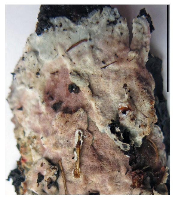
Fig. 3. Skeletocutis lilacina on fallen trunk of Picea obovata (INEP 1450). Scale bar: 2 cm.

S. lilacina was not mentioned for the Republic of Karelia (Krutov et al., 2014), but it is recorded from the Paanajarvi National Park