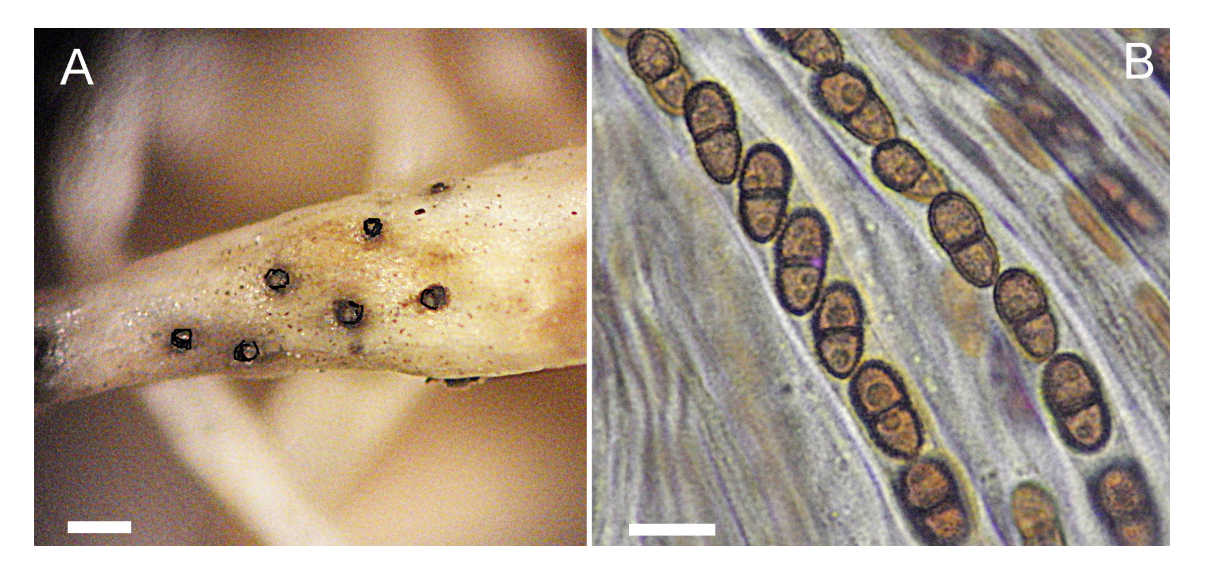
Fig. 2. Holotype (TFC Lich 16041). A – habitus, perithecia in thallus of Ramalina . B – ascospores in ascus. Scale: A - 0.2 mm; B - 10 \mu m.

Description: Ascomata lichenicolous, perithecioid, scattered, subglobose to globose, sometimes flattened, immersed, with visible ostiole, in section up to 250 µm in diam.; ascomatal wall pale to medium brown, consisting of about 3-6 layers of cells, c. 10-15 µm thick, composed of angular cells, cells up to 12 µm wide; hamathecial filaments present at maturity, sometimes branched and anastomosing, 1–1.5(–2) µm thick, hymenial gelatine I-; asci narrowly cylindrical to slightly clavate, apically thickened when mature, with a small ocular chamber, ascal wall I– and KI– in all parts, 8-spored, 75-95 \times 7-9 um; ascospores obliquely monostichous in the asci, sometimes slightly overlapping, ellipsoid, mostly constricted at the septum, when young hyaline to pale brown without a perispore, soon dark brown, fine warted when mature, 1-septate, septum sometimes formed towards