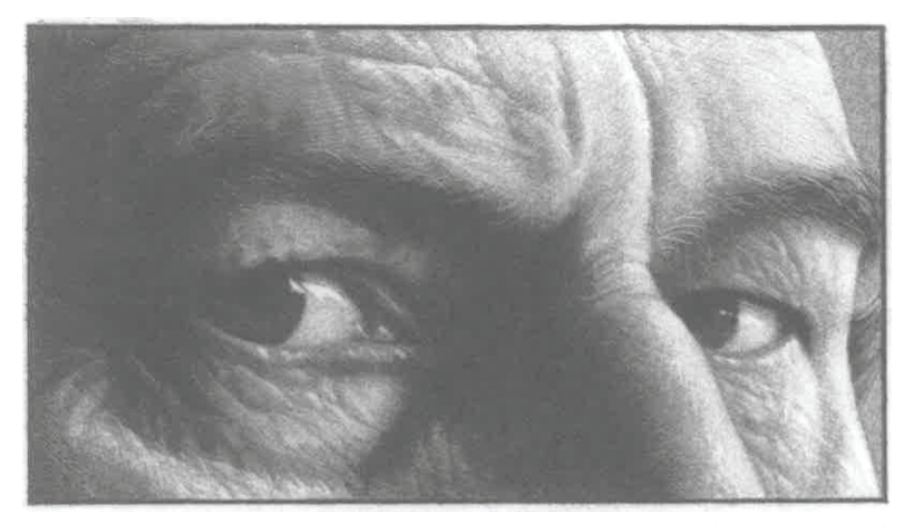
Fig. 2. Jan Peter Tripp, etching accompanying the poem "Es heißt" (Sebald 2003: 48)

Reading this poem after the English version, I would suggest, need not entail a revelation of what the poem "actually" means. My point here is that the second poem does not make blood and grass the proper referents of the English poem, "grün wie / Gras" thus eclipsing the simple "green". Instead, what the collocation of these poems brings to the fore is, precisely, the difference between an unspecified, pure green and one that is part of a natural landscape, or between reference as a subtle echo and as an unambiguous statement. The English poem is quasi-blind to figurativity, as it were: it utters colour pure and simple, while simultaneously drawing attention to its impurity and complexity. In the German poem, by contrast, figurativity takes precedence over pure colour: it speaks not of red but of blood, and the green is explicitly that of grass. Reading them together – as a differential poem – places the emphasis not on either text, but on the gap between them.