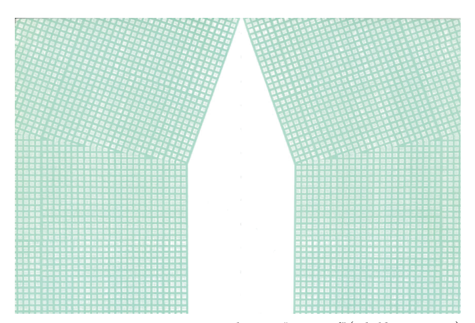
Fig. 3. Tess Jaray, painting accompanying the poem "It was as if" (Sebald 2001: 58–59)

Something similar could be said about the painting's relation to iconic reference. As Sebald's words are projected onto this ostensibly abstract image, it begins to partake, as it were, of their referentiality. Interpreted together with "It was as if", the white opening in the middle of this painting could be seen as if it were an extreme magnification of the upper half of a stylized needle's eye. Only "as if", of course: it will not yield completely to figurativity, but keeps insisting on its material, non-representational presence. Interpreted as an image of the eye of a needle, the painting is in and of itself a vision of an excessive close-up: in order to see the eye of a needle in this fashion – as too big even to fit into one's field of vision; there is room only for the upper half – one's optical instrument needs to be set to a level of almost absurd detail.