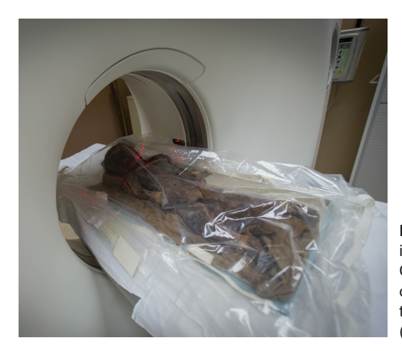
Figure 1. Child mummy from Peru in CT scanner. Mummy from the Collection of the Buffalo Museum of Science (C2818), photo courtesy Buffalo Museum of Science (Onion Studio).