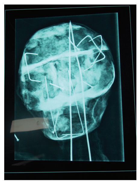
Figure 2. Rendswühren Man: reconstruction of the skull using wire and unknown materials. Image by Heather Gill-Frerking.

1871, it was noted that the mummy had several fractures to the face and skull. Specifically, a "triangle-shaped injury" over the nasal bone; loose pieces of the frontal bone; a "star-shaped" fracture radiated from the underside of the right orbit through to the temporal bone and a shattered right parietal bone (12, 18) were identified. The interpretation at the time was that the temporal and parietal bones were damaged by a blow to the head, which seemed to have come from the right side of the head towards the left and would have caused the injuries to the skull (12). Since there was little other evidence for trauma or pathology on the body, it is possible that these reported injuries may have been the cause of death for this man. Since there are no pieces of the skull remaining, despite an impressively report. In bog bodies, postmortem fractures often misinterpreted as perimortem. Owing to the conservation, and the unfortunate loss of the skull bones, the cause of death for the Rendswühren Man must remain purely speculative and can only be based on the autopsy report.