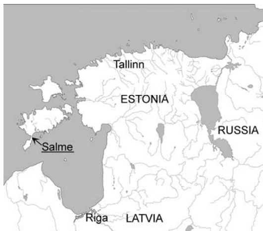
Figure 1. Location of the Salme village.

of bodies inside the boat contour were concluded on the basis of photos taken during the archaeological works and the information derived from the bone assemblages packed as one unit was taken into account. Comparing the photos of skeletons and bones, collected as one unit, some conclusions concerning the placement and positions of the bodies in boat were possible.