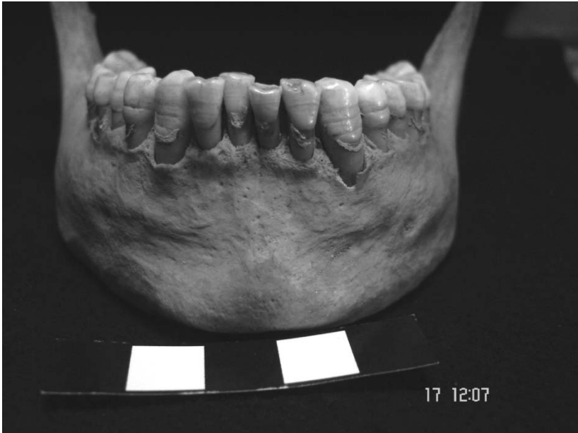
Figure 2. Gross linear enamel hypoplasia in the form of grooves affecting the anterior and posterior mandibular teeth in a male individual aged 35–40 years (burial 23).

After observing 19 juvenile dentitions and 157 deciduous and permanent teeth, no hypoplastic defects were found (0.0%).