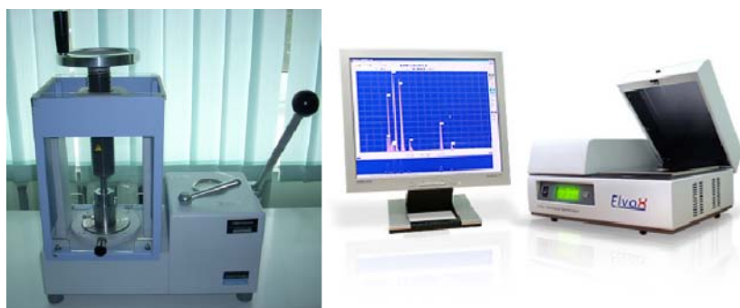
Figure 1. Stages of sample preparation for XRF.