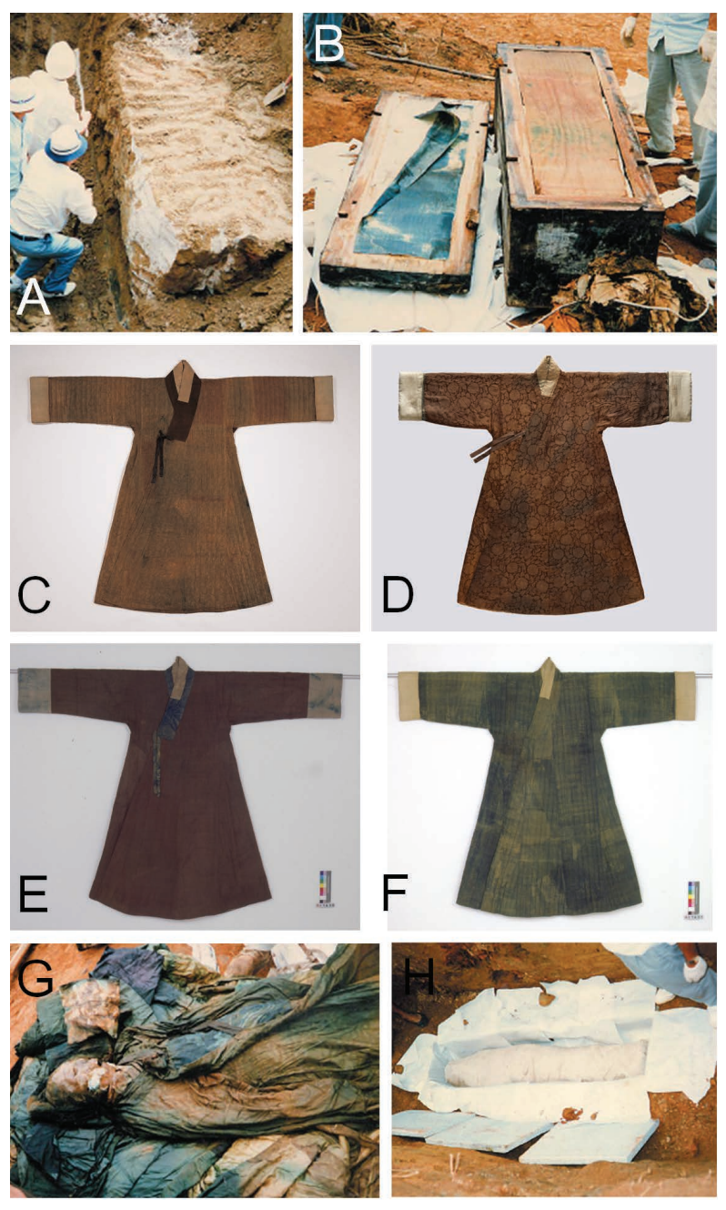
Figure 1. Lady Yeoheung Min's tomb. (A) The lime-soil mixture barrier of the tomb was removed. (B) Coffin lid was removed. Preservation status of coffin was superb. (C) to (F) Different types of Jangot (women's coat) collected from the coffin. (G) Mummified Lady Yeoheung Min. (H) The lady's mummified body was reburied in the new family cemetery.