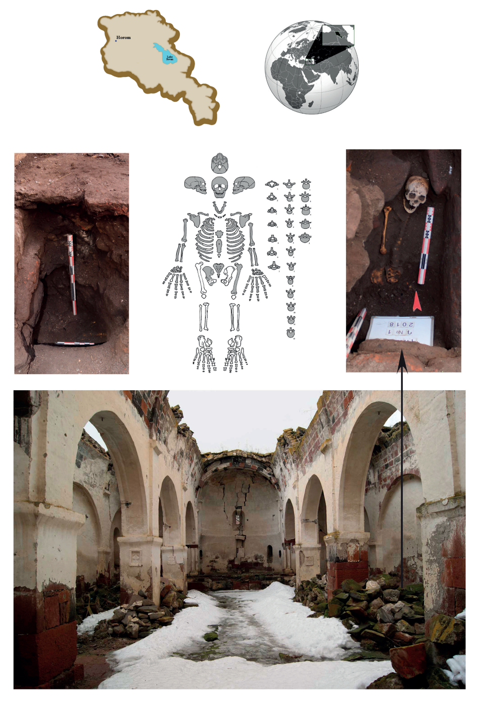
Figure 1. St Hripsime Church, plan of Burial 1 (in situ, with a curved spine), available skeletal elements from Burial 1 in St Hripsime Church