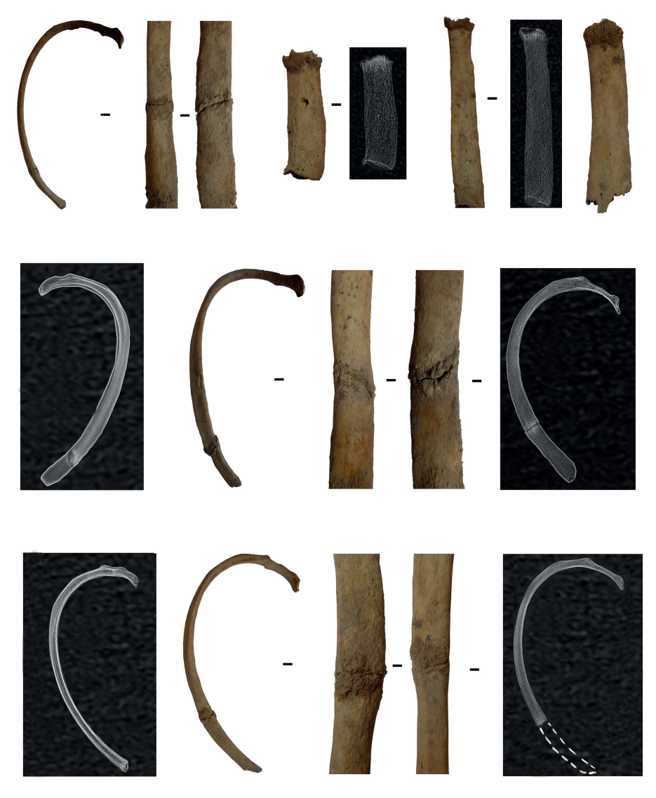
Figure 3. Multiple rib fractures

appearing with anterior kyphosis of the lower lumbar vertebrae, contributed towards obstructing the pelvic canal. The angulation deformity was severe and noticeable (Figure 2–11).