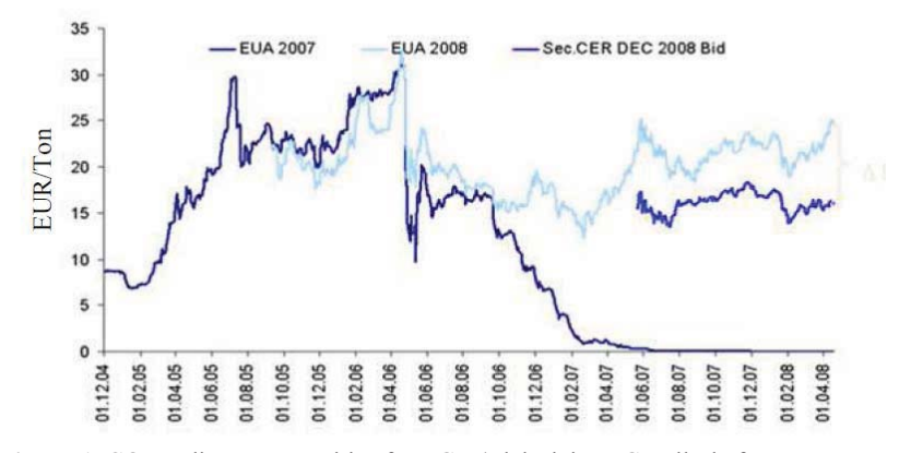
Figure 1. CO<sub>2</sub> trading opportunities for EGL (Elektrizitäts-Gesellschaft Laufenburg). (EGL 2008)

Figure 1 depicts the EUA (European Union Allowances) price fluctuations from December 2004 till April 2008. Sharp declines in May 2006 and in 2007 were caused by the situation in the market where, after the first certified emissions had been publicized, it turned out that there were actually more units available in the market than there was demand for them. In other words, until May-April 2006 when real emissions into the air in the first so-called trading year were identified, the ratio of the emission allowances available on the market to actual emissions was not yet known to the public (e.g. for 2005 the European Commission allocated the emission limit of 16,747,053 t/CO<sub>2</sub> to Estonia but the real emissions were 12, 621,824 t/CO<sub>2</sub>, or nearly 4 million tonnes of emission allowances were put on the market (Climate web 2010).