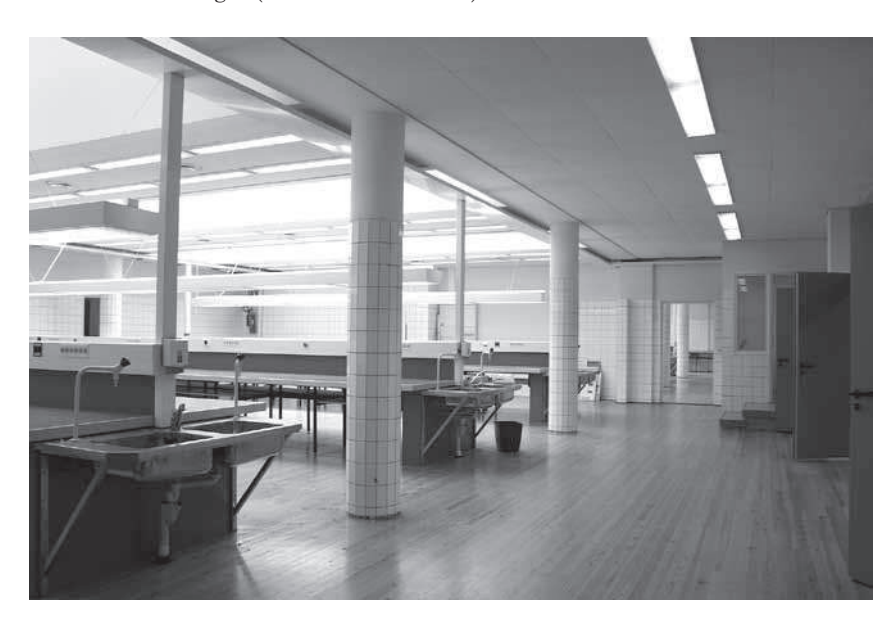
Pic 4. Partly renovated (new worktables above old ones) laboratory of physics at the main building of Helsinki University of Technology (now Aalto) in August 2011; original design by Alvar Aalto