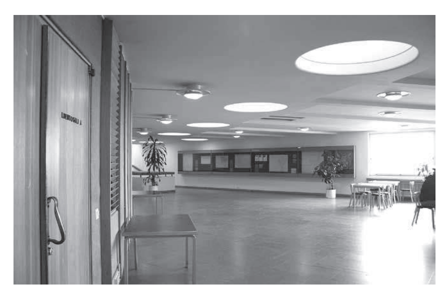
Pic 7. Main hall of the main building of HUT. In the middle are shown wall cabinets made in 1998 for a history exhibition – these cabinets are updated and reused in situ year 2011. Exhibitions are integrated in departments since there is no actual museum

main building of HUT are the shape and interiors of the amphitheatre-like auditorium, entrance halls in the main hall and those of the department of architecture and land surveying, the long corridors connecting the three and the additional "fingers" with upper light or sidelight depending on the location of the corridor in the plan. The newest idea from AU Properties Ltd is to demolish these walls between old drawing halls and central corridors and build all dividing walls of glass and put students, researchers and assisting administration staff in open-plan offices, just because it is so fashionable and new (this was so some twenty-forty years ago). These alteration plans are also going to ruin the main architectural interior features of the main building and also endanger the work peace of students, teachers and researchers. What makes it worse is that they thought of this plan when recent studies have shown that open-plan offices are non-efficient as a workplace. Why do non-professionals want to do