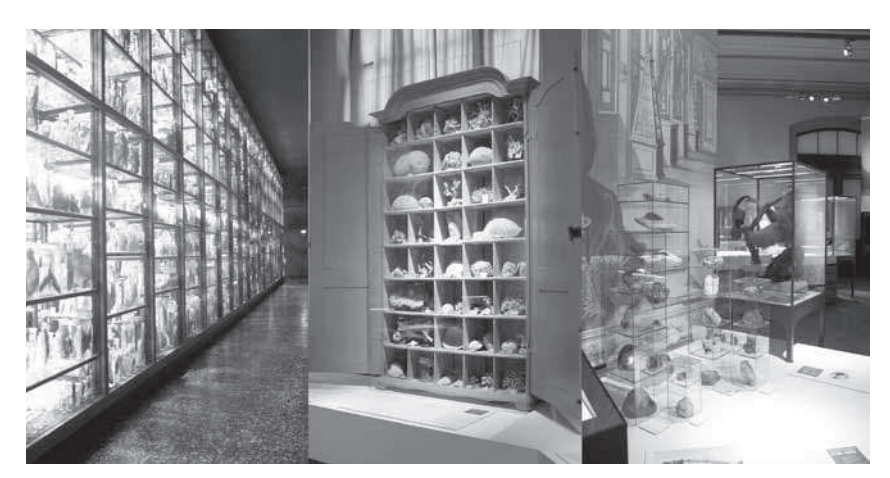
Pic 1. Natural history museum of Berlin and three different samples. From left "wet collection in 21<sup>st</sup> century style", "learned cabinet from 18<sup>th</sup> century" and exhibition with new and original cabinets – typical 18<sup>th</sup> and 19<sup>th</sup> century array as a picture on the background

Different ways of exhibiting various collections, spaces related to the collections and documents depend much on usable resources and possible users as well as money, space, and the nature of collection itself, its quality and quantity. The policy of one truth, one universal exhibition ideology and graphical layout often leads to a situation where once you have seen one collection/museum, you have seen them all. Is it really necessary to wipe out all traces of previous permanent (collection) exhibitions just because they are shown in "old, out-of-date" style? Is it not part of history and science itself to show how a collection was previously, and possibly originally, exhibited? The original interiors, showcases, arrangement of objects and information papers are an essential part of history of sharing information. By showing different and original ways of exhibiting objects from different eras you also pose a question: can you notice how the ways of doing science, knowledge and way of sharing information change? Can you relate this showpiece to its historical context and the world around it? History has numerous levels and as many viewpoints as there are viewers (pic 1).