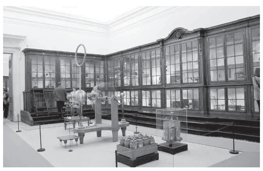
Pic 2. Cabinet of Physics at the University of Coimbra (Portugal), first room is in original array and shape. Cabinet is dated back to 1780's and in the middle are shown devices for researching electricity. Devices are constructed of timber, glass and brass/copper