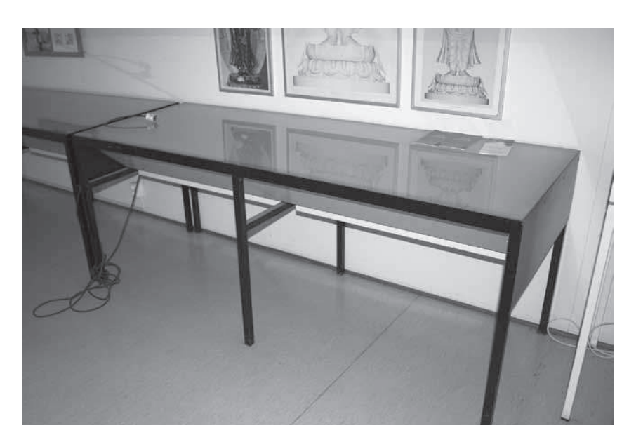
Pic 5. Stripping table designed for land surveying department. Unique set of furniture that will have a new life as exhibition table and after remodelling, cabinet