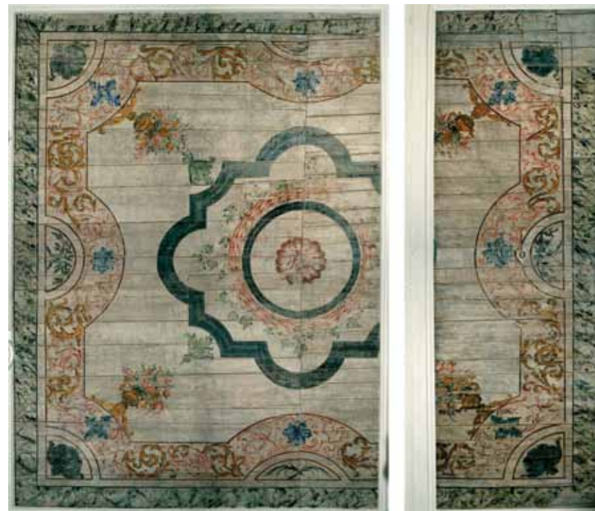
Fig. 3. Rahukohtu 5 ceiling after conservation.

was to preserve and display both historical layers – the eighteenth century painted ceiling panelling, and the nineteenth century division of space with the exuberant dentil cornice – simultaneously. Promoting the perception of aesthetic composition in its unity, a display area is placed within the dividing wall. Such decision emerged as a compromise between the reality of a historical artefact and contemporary needs of its inhabitants. The final solution won out among all parties and enabled the owner of the estate to open the artistic monument for wider public: the painting can now be