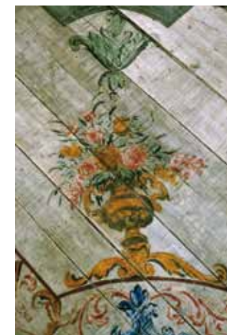
Fig. 4. Rahukohtu 5 ceiling. A detail after conservation.

was to preserve and display both historical layers – the eighteenth century painted ceiling panelling, and the nineteenth century division of space with the exuberant dentil cornice – simultaneously. Promoting the perception of aesthetic composition in its unity, a display area is placed within the dividing wall. Such decision emerged as a compromise between the reality of a historical artefact and contemporary needs of its inhabitants. The final solution won out among all parties and enabled the owner of the estate to open the artistic monument for wider public: the painting can now be