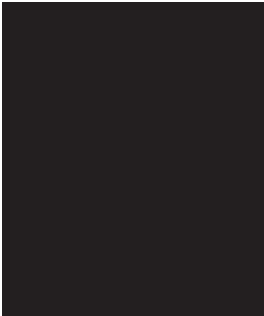
Fig. 2. Scene of the Temptation of Adam and Eve from a so-called "sidestone". Beginning of the 16th century. Museum of the History of Riga and Navigation.

the altars and crosses, destroyed the relics and broke the tombstones." 18 According to him, the same fate befell other churches where members of the Blackheads Compagnie had installed altars. With the call to get rid of Catholic "idolatry blindness", the scope of Livonia's fanatic dem-