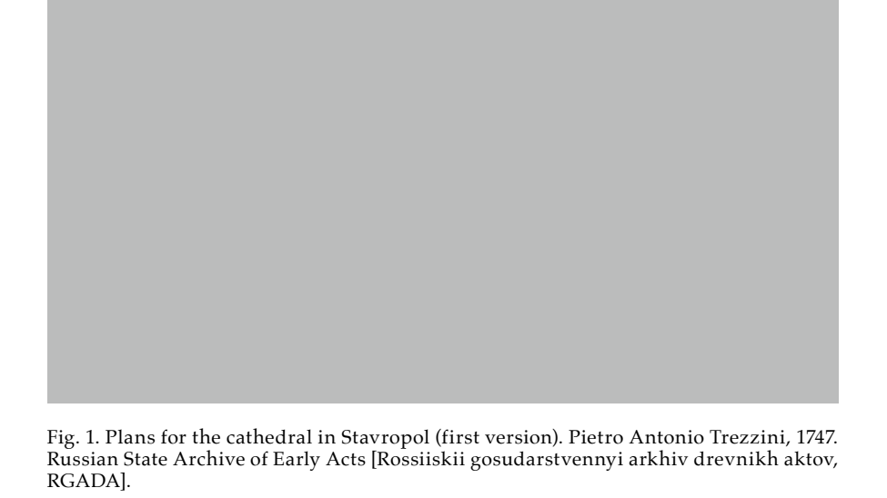
Fig. 2. Plans for the cathedral in Stavropol (second version). Pietro Antonio Trezzini, 1747. RGADA.