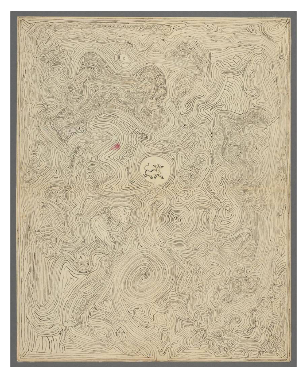
Figure 2 . Peirce's labyrinth (Charles Sanders Peirce papers, MS Am 1537, Houghton Library, Harvard University, undated)<sup>1</sup>.

(2) From the Harvard Archive of Peirce's graphics and letters: an intricate line drawing made up of a network of intersecting passages, which appears to represent a maze or labyrinth (Fig. 2).