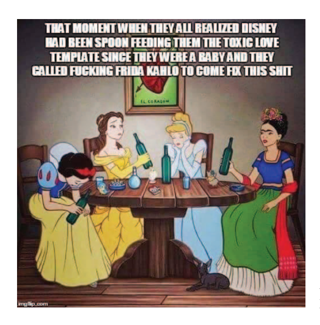
Figure 2. Desperate Disney princesses and Frida Kahlo.

It is also possible to find in the world wide web a variety of popular publications that are compiled from memes making fun of Disney's unrealistic body images and submissive female characters (Fig. 3)<sup>16</sup>; there is a selection of bad dating advice from princesses<sup>17</sup>; and there are numerous fanfics<sup>18</sup> in which Disney princesses rebel against their traditional world, fall in love with each other, and even become aggressive to the extent that they can win the murderous Hunger Games<sup>19</sup>. With their various creative utterances about the animations, the contemporary audience in its own way deconstructs the artistic language of the Disney tale, appeals to the Disney Princess text-code, and rethinks the pervasive romantic myth. The romantic myth touches one of the most sensitive fields of human life, resonates with diverse love stories (romantic comedies, dramas, soap operas) that are told in different artistic languages and affects the reception of Disney animations. Many readers and viewers do not only show that real life is not a fairy tale and that love stories are much more complicated and ambiguous than those in Disney animations, but also demonstrate that they do not yearn for the old tales anymore.