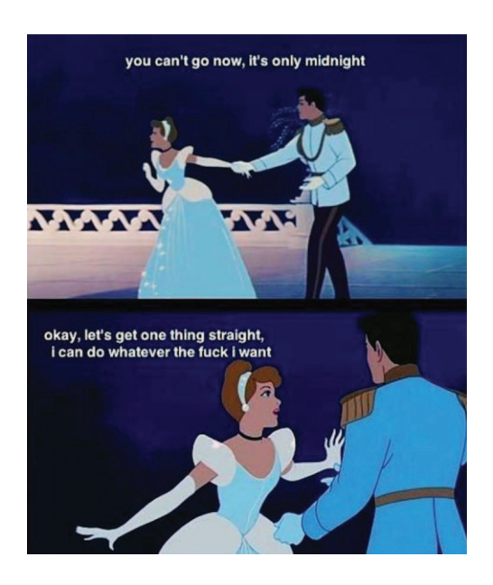
Figure 3. A rebellious and independent Cinderella.

In this connection it is significant that, unlike the majority of professional critics, the broad audience not only notices but also admires the line of self-determination in the animations from the epoch of the renaissance and a whole new wave of post-feminist Disney characters. For instance, there is a series of publications wherein the authors try to justify the positive role of Disney in culture by showing how in different (even classic) animations female protagonists are searching for new worlds, new paths in life and their own special destiny<sup>20</sup>. There are publications with analysis of the evolution of Disney's female characters<sup>21</sup>, and classifications of princesses on a scale ranging from less to more feminist. Still, the latest animations are not always considered to be the most progressive; while acknowledging the revolutionary texts of Princesses Moana and Elsa, author-fans also see Mulan and Pocahontas as powerful and independent heroines<sup>22</sup>.