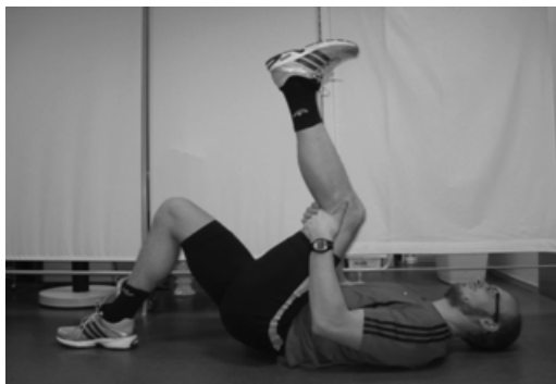
Figure 1. Static stretching exercise.

every set. An athlete had 30-s pause to rest, sitting on the chair with back supported.