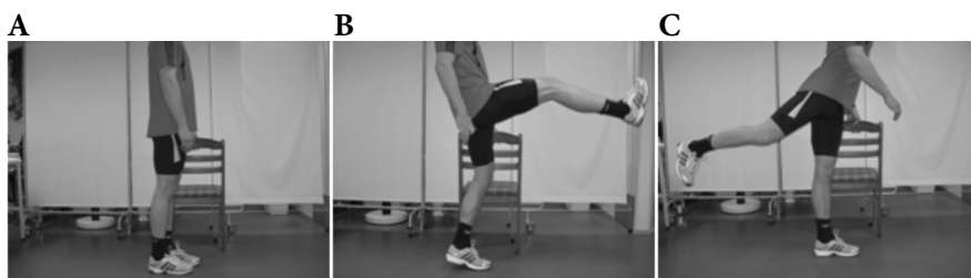
Figure 2. Dynamic stretching exercise. A – initial position; B – leg forward, C – leg backward.

Dynamic stretching exercise is shown on Figure 2. In dynamic stretching subject was standing next to the wall and flourish leg front and back at the frequency of 60 bpm controlled by electrical metronome. Knee was flexed at the knee to provide hamstring stretching. Exercise was made three times in 3 sets with duration of 20 s for both legs. Between every set 30-s rest period was allowed.