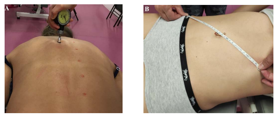
Figure 1. A. Using algometer to measure pain pressure threshold of paraspinal muscles. B. Measurement of rib-pelvic distance.

An algometer (Wagner Instruments FPK 20, Greenwich, USA) was used to measure the pressure pain threshold of paraspinal muscles bilaterally from superior nuchal line down to posterior superior iliac spine, applying pressure after every 5 cm (Figure 1, A). The subject was instructed to give a signal immediately when the sensation of pressure became a painful sensation in order to establish her pain threshold (kg/cm<sup>2</sup>) [3]. The values of individual points of each side of body were summed and divided with the number of points.