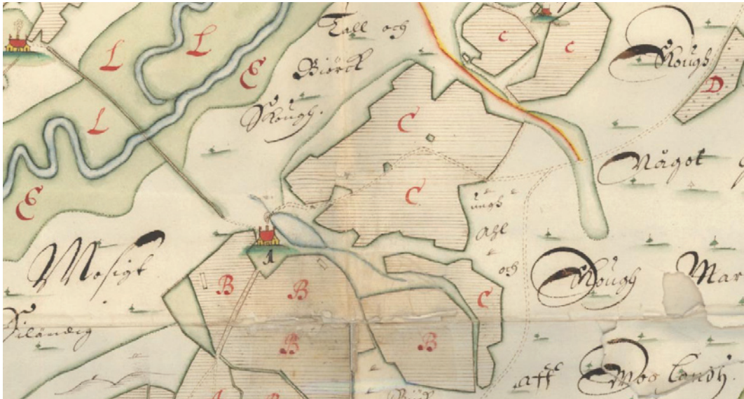
Fig. 4. Mõniste manor on the Swedish cadastre map from 1684.

Jn 4. Mõniste mõis 1684. aasta Rootsi katastrikaardil. (EAA 308-2-172.)