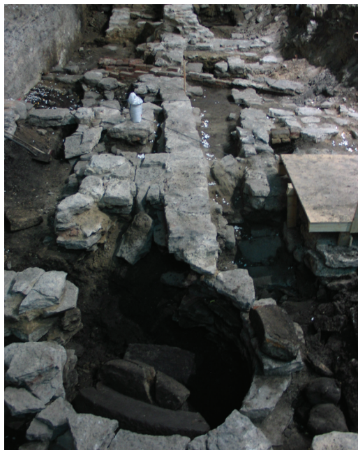
Fig. 2. On-site situation: in the forefront the well together with the curb stones found in it. View from north-west.

Jn 2. Esiplaanil kaev koos sellest leitud ääris-kividega. Vaade loodest.