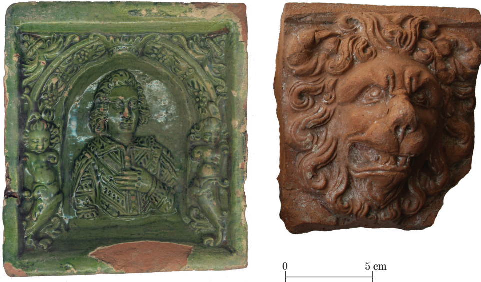
Fig. 4. Finds from the larger well. The left one depicts Duke of Mecklenburg-Schwerin Adolf Friedrich I (r. 1592–1628).

Jn 4. Ahjukeraamikat suuremast kaevust. Vasakpoolsel on Mecklenburg-Schwerini hertsog Adolf Friedrich I (valitsusaeg 1592–1628).