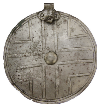
Fig. 4. Bracteate pendant.