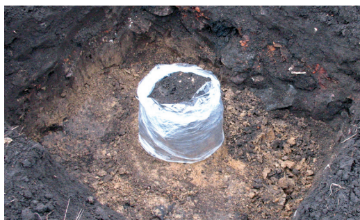
Fig. 2. Block of Sargvere hoard before removing from the ground.

Jn 2. Sargvere aarde monoliit enne pinnasest eemaldamist.