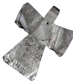
Fig. 5. Anthony's cross shaped pendant.