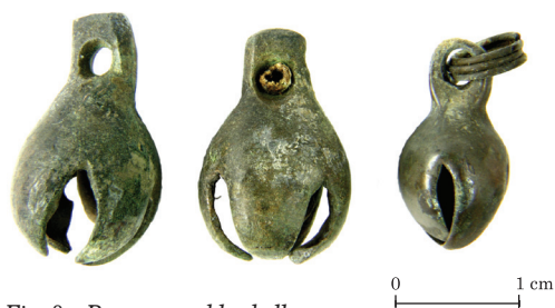
Fig. 8. Bronze rumbler bells.