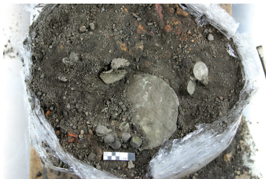
Fig. 3. Block of Sargvere hoard, partially exposed.

Jn 3. Sargvere aarde monoliit osaliselt väljapuhas- tatuna.