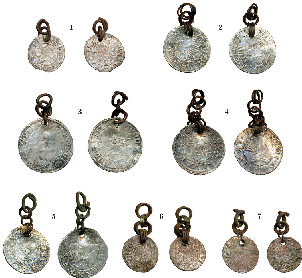
Fig. 6. Coin pendants.