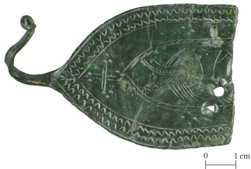
Fig. 6. Fragment of a copper alloy ornament with traces of secondary usage from Loopre (Järva County, no. 30).

Jn 6. Taaskasutusjälgedega vasesulamist ehtekatke Looprest.