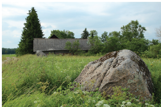
Fig. 3. Cup-marked stones in Lau (nos. 92 & 93).