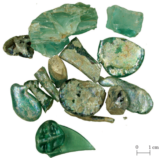
Fig. 2. Glass debris and a bottle seal (on the left below, from Laeva Veneküla (no. 102).

Jn 2. Klaasitootmisjääd ja pudelipitser Laeva Venekülalt.