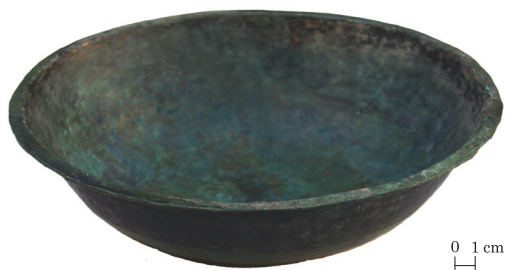
Fig. 5. Bronze 'hanseatic' bowl from Puru (Ida-Viru County, No. 22).