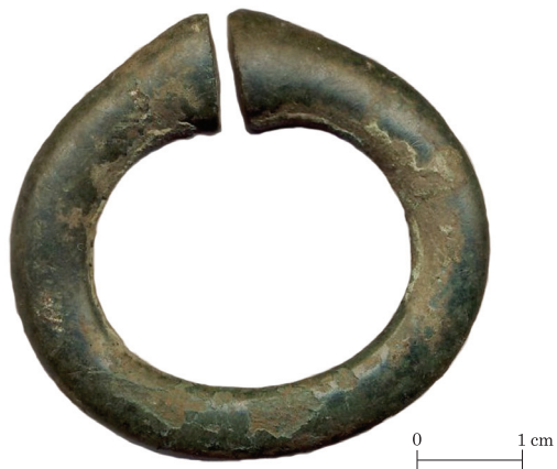
Fig. 4. Late Iron Age bronze brooch from Maeru (no. 9).

In western Estonia an Iron Age settlement site (no. 89) was located by Margo Puuram while collecting fragments of bronze ornaments in Halinga municipality, Pärnu County. A stray find of a chain hanger with a chain fragment (no. 91) from the Late Iron Age was unearthed by Andre Mõttus in Häädemeeste municipality. So far it has not been possible to relate this find with archaeological context (e.g. burial place or settlement site).