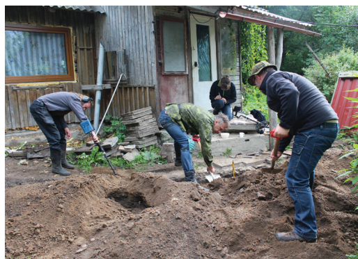
Fig. 1. Preparations for excavations. Jn 1. Ettevalmistused kaevamisteks.

The landowner dug the trench a few meters away from the west side of the building. The find spot was situated in the west side of the trench. A hexagonal, ca. 1.5 m 2