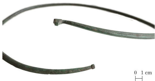
Fig. 5. Example of the terminals of Kõue neck rings.

Two bronze beads (bi-conical and round) and remains of presumably a dozen glass beads (bi-conical, round and ribbed) made from green glass were found. Colourful necklaces were usually preferred as finds from other wealth deposits and