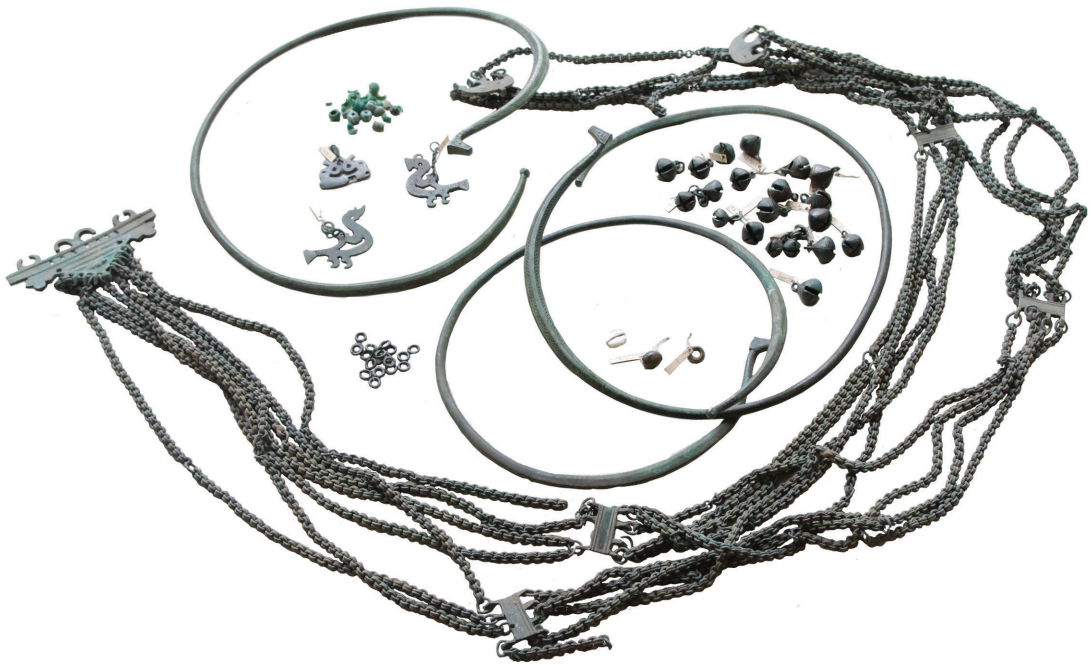
Fig. 2. Wealth deposit from Kõue. Jn 2. Kõue peitvara. (AI 7134: 1–13.)