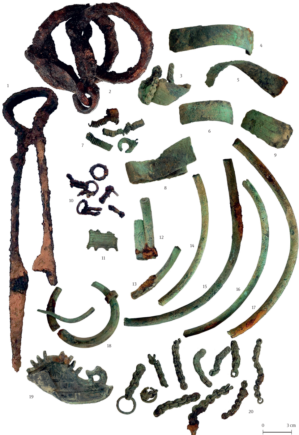
Fig. 5. Artefacts from complex no 4. Not all fragments are shown.

Jn 5. Kompleksi nr 4 esemed. Kõiki fragmente pole näidatud.