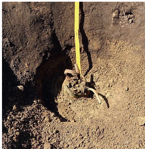
Fig. 4. Complex no 4 in situ.

Find complexes without cremation deposits, sometimes placed in or near burial grounds, are known in different places in Saaremaa, coastal Estonia and the Livic area (e.g. Šnore 1996, 114–115), as well as in Couronia (Griciuvienė 2009). The custom also appeared in other districts, but less frequently. As some examples, similar find deposits are recorded in Viltina Kāo-Matsi in Saaremaa (Mägi 2000; 2006), Keskvare and Kurese in West Estonia (Mandel 2003, 104–105, pl. LIV; 2017), Kõue in Harjumaa and Öötla in the other side of the wetland zone separating coastal Estonia from the rest of the country (Kurisoo 2014). Such artefact deposits in Estonia seem to characterise predominantly the Viking Age up to the middle of the 11th century, but some complexes, especially in inland Estonia, can also be dated to the 11th–12th century.