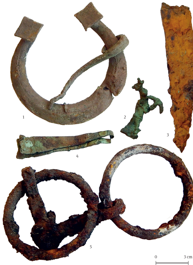
Fig. 3. Artefacts from complex no 2.

Complex no 2 (Fig. 3) was ca. 7 m west of the complex no 1, in the depth of app. 30 cm, and consisted of a seax, a big penannular brooch with funnel-shaped terminals, iron bits and a belt with metal fittings. The partly preserved seax was found in vertical position, other finds along it, and the bits on top of the others. The brooch was broken into two parts, and at least one strap-divider had been in fire. It is unknown whether the fire marks were caused by the same fire that had created all the sooty area, or were results of some specific ritual. All artefacts had probably been placed in a cylindrical vessel of some perishable material (see also Complex no 4), which had stood on the ground. The sandy natural soil began right under the find. As for the Complex no 1, some cremated bones, as well as tiny metal pieces, perhaps originating from the same belt fittings, were reported near the find place during later investigation.