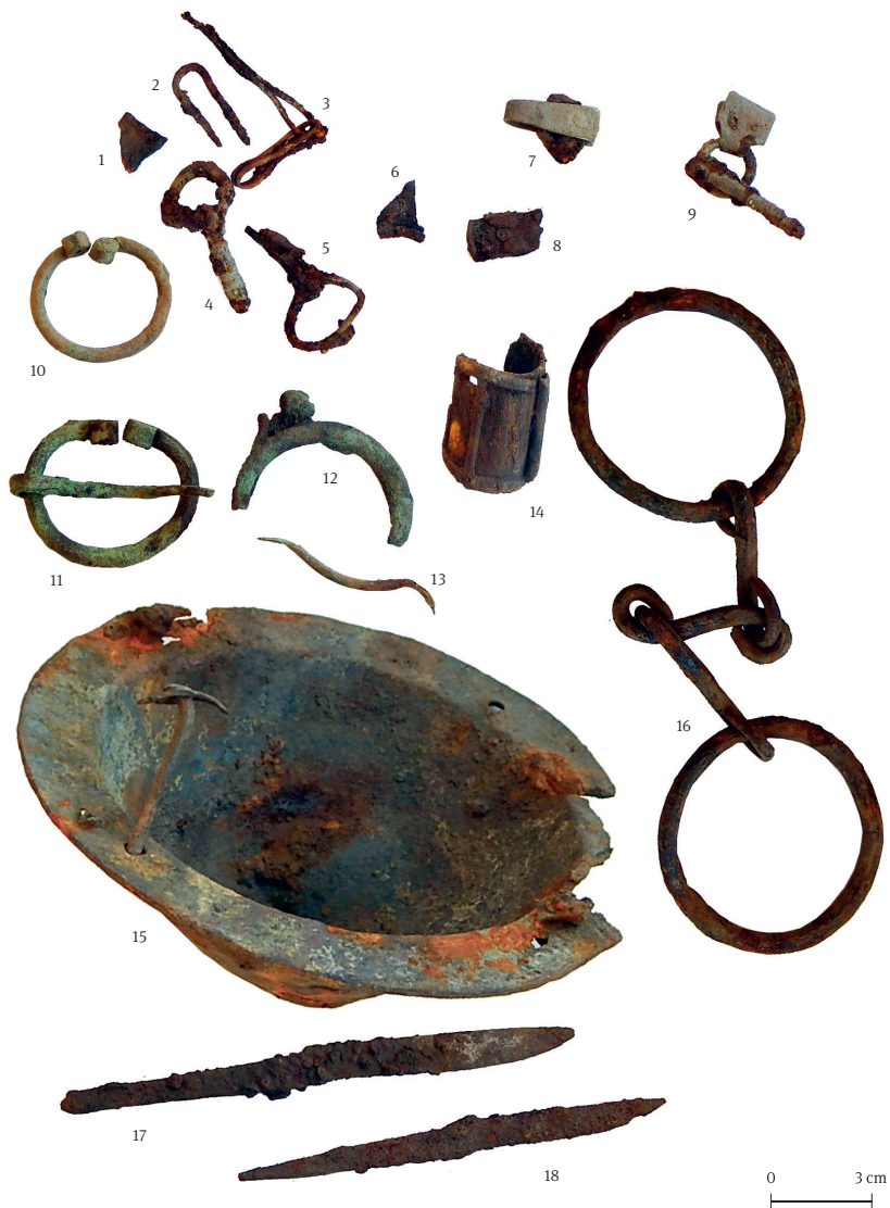
Fig. 2. Artefacts from complex no 1. Not all fragments are shown. Jn 2. Kompleksi nr 1 esemed. Kõiki fragmente pole näidatud. (SM 10847: 15, 13, 10, 12, 16, 15, 14, 9, 17, 4, 3, 2, 11, 5, 1, 6, 7, 8.)

Complex no 1 (Fig. 2) was found in the depth of 30 cm, in the sooty lowest layer of dark soil. Neither bones nor stones were recorded, and there were no signs of a pit. Two knives had been laid directly on the sandy ground and covered with a shield that had its inner side upwards. Only an iron shield-boss had survived of the shield, while its wooden parts had burnt or decayed. The boss had been used as a vessel for several broken or only partly represented artefacts: iron bits, three penannular brooches, a belt with metal fittings, and an iron cylindrical padlock. Kangert and Kivirüüt have reported that they later found some burnt bones in the vicinity of the find place (Kangert & Kivirüüt 2018), but whether they belonged to humans or were at all connected with the find complex is unknown.