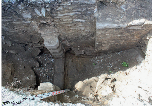
Fig. 4. The portal and two cellar rooms. Jn 4. Raidkiviportaali ja kaks keldriruumi.

adhering to the walls, most extensively on the internal side of the southern wall (Fig. 4) – it was unpainted and undecorated. Traces of plaster were visible on most of the walls that were uncovered. Although contact with fresh air did cause some weathering, on the first sight, however, it did not cause substantial damage to the plaster.