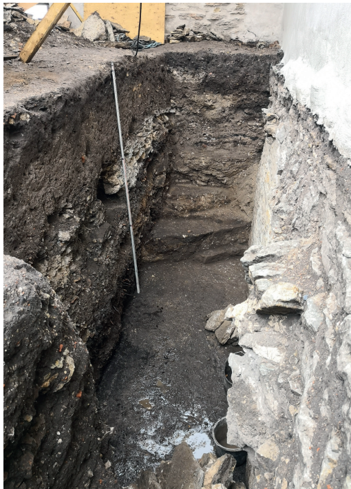
Fig. 6. View towards the edge of the plateau at Toom-Kooli St. 23. The edge of the quarry forms a natural 'wall'.

During the 2018 season, an intermittent watching brief was carried out on the site of Toom-Kooli St. 23 (Fig. 1, 2) where the medieval limestone quarry cuts had been discovered in and around the small 13th-century cellar the year before. Prior to the excavation and survey in 2017, the post-medieval building did not have any other cellar rooms but during the construction work, a large area under the building was uncovered. This was extended in 2018 to include the northern side of the plot and the western side of the courtyard for a separate entrance. Both of these fairly large-scale earthworks revealed even more traces of the early