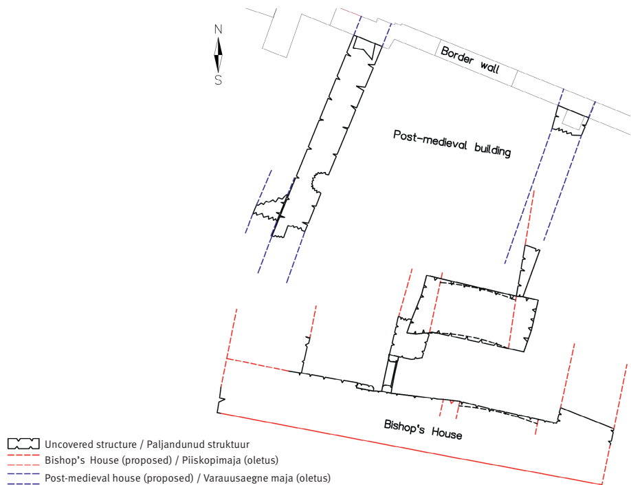
Fig. 3. Buildings discovered at the Bishop's Garden during the 2018 season.

Jn 3. Piiskopi aiast 2018. aasta kaevamiste käigus avastatud hooned.