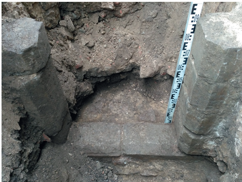
Fig. 2. 15th–16th century hewn portal remnants between two cellar rooms.

Jn 2. 15.–16. sajandi raidkiviportaali jäänused kahe keldriruumi vahel.