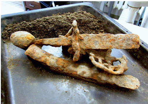
Fig. 6. 17th–18th century sword fragments from Vetiku in the conservation laboratory of the Scientific Research collections of TLU AT (no 79).

Considering the post-medieval (from the end of the 16th century onwards) stray finds, the types of artefacts have been changed in comparison with earlier periods. The most obvious change is the sharp increase in coins; many of them are low valuables, which might have been lost by accident. However, as in the Middle Ages the number of finger-rings is high. Approximately half of them are signet rings, usually dated to the 16th–17th centuries. Other ornaments do not occur often: only some pendants, heart-shaped brooches, and small round brooches can be named. The belt adornments, mounts and buckles are again more numerous. Buttons, tobacco pipe covers and cleaners, horse harness bits typical to the period, often are obviously of the 18th–19th century dating, thus, these finds are usually not listed in the table. One remarkable stray find was made in Vetiku, where a broken 17th–18th century sword was unearthed (no 79; Fig. 6).