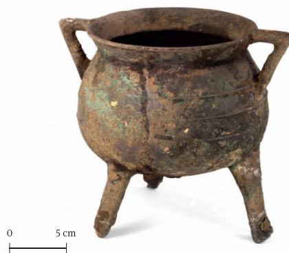
Fig. 5. Copper alloy Late Medieval tripod from Ruhnu (no 104).

Only one village cemetery in Õruste (no 120), which was already previously known and has been under search by means of metal detectors already several years, has been reported