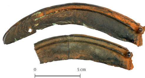
Fig. 2. Two rare Bronze Age sickles from Uuri (no 25). Jn 2. Kaks haruldast pronksiaegset sirpi Uurist.

The number of Bronze Age objects has increased already for years (Rammo & Kangert 2018, 209 and references there). However, this year only three find spots have been listed. A unique bronze artefact in the context of the Baltic Sea region was discovered in Kõrkküla (no 73). The socketed lozenge-shaped and two-bladed narrow item is slightly smaller than a spearhead and larger than an arrowhead in comparison with similar finds of Northern Europe (Paavel 2018). Thus, it is not possible to determine the exact function of the item. Another intriguing discovery is that of two identical Late Bronze Age (1100–500 BC) sickles, which were found together in Uuri (no 25; Fig. 2). Kristiina Paavel suggests that these items that definitely have been used were deposited in the find spot deliberately (Paavel 2019). Only two Bronze Age sickles were known in Estonia before the Uuri find (Lang 2007, 108). The third find from that period is a Late Bronze Age socketed axe, which comes from Alavere village next to Laiuse (no 44). The find spot is already known previously. Mauri Kiudsoo regards the area as part of a larger Late Iron Age sacrificial site, from where a hoard, numerous ornaments as well as horse bones have been detected (Kiudsoo 2014, 221–223). The area is located in the peripheral part of a one-time fen, which is reclaimed now.