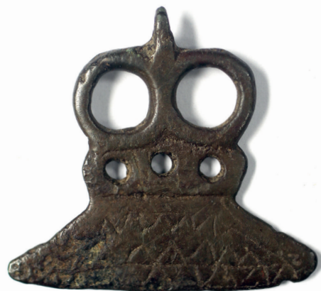
Fig. 4. Pendant, which was accidentally found in a flowerbed in Kuimetsa (no 84).

Three finds represent Finnish ornament types, which have been relatively rare in Estonia until recently (e.g. Luik 1998; Kiudsoo et al. 2012; Kiudsoo 2016, 62–64). First, a Viking Age