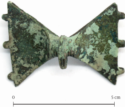
Fig. 3. Roman Iron Age symmetrical fibula from Suure-Rootsi (no 105).

In several cases Roman Iron Age ornaments, especially brooches have been collected. One of the most spectacular find spots is situated on the Hara Island, from where fragments of at least five eye brooches were collected (no 2). However, the nature of the site remains unclear at the present state of study. Two fragments of crossbow brooches and a fragment of a penannular brooch with colourful enamel decoration from Kautjala (no 5), fragments of two brooches and a finger-ring from Voorepera (no 41), and a symmetrical fibula (Fig. 3) together with two bracelets from Suure-Rootsi (no 105) also belong to the Roman Iron Age. Some of these finds could indicate perished burial sites. Only one Roman coin has been listed in the table this year. It was found in Vanamõisa together with a Roman Iron Age round open-work pendant (no 126).