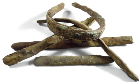
Fig. 7. Copper alloy ingots from Pedassaare (no 76).

Some artefact types have been used for a long period, without any change in their appearance. For example, an oval strike-a-light stone was discovered in the course of construction works in Uhtna (no 78). These stones probably used for making fire have been dated to the long period from the Roman Iron Age until the Pre-Viking Age. About 100 such stones have been found in Estonia, mostly as stray finds (Tvauri 2012, 88; Johanson 2018b). A second stone item impossible to date precisely is a disc-shaped spindle whorl made of stone and adorned with small concavities, found from Mõhküla (no 49). Similar spindle whorls have been used at least for nearly a 1000 years; such specimens occur from the Middle Iron Age until the Early Modern Period (Luik 2019b). Thirdly, an extraordinary discovery is a deposit of five copper alloy ingots from Pedassaare (no 76; Fig. 7). Regrettably, the deposit is not possible to date as the ingots looked alike throughout a very long period, and the owner of the metal could have been lived from the Roman Iron Age to the beginning of the Middle Ages in Estonia (Kiudsoo 2019b).