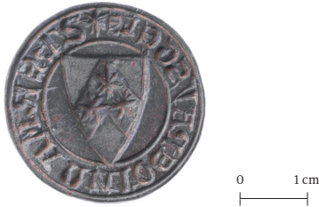
Fig. 6. Seal from Selli (no. 103).

record of Estonia (Kurisoo 2021, 269–270) and all items that are human-shaped or feature anthropomorphic elements such as faces stand out. The origin of this find as well as its date need some further research, but it can be speculated that this object may date from the Final Iron Age or somewhat later. The second object is a rare 13th–14th century seal from Selli (no. 103). It has a simple design (Fig. 6), depicting a coat of arms, the inscription around the rim is clear and reads S'hERMANNI DE PAI'SGELE 'seal (S = Sigillum) that belongs to Hermann from Paisgele / Pavsgelē', but the origin of the seal is still open (Russov 2021d). According to Erki Russov (2021d), the shield in the middle of the seal indicates that Hermann had a status of a vassal and he was not a member of the clergy. It is likely that the seal