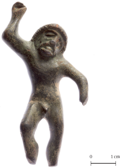
Fig. 3. Äherdi (no. 215) Wild Man. Fig. 3. Äherdi (nr 215) metsmees. (AI 8461.)