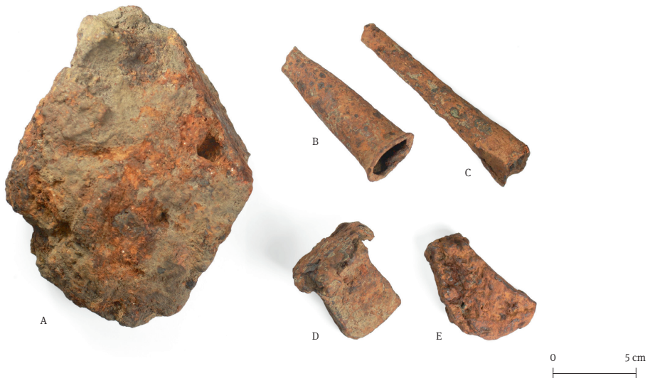
Fig. 4. Objects related to iron metallurgy from Sürgavere (no. 268) A and Lümandu (no. 211) B–E.

the most significant discovery is an iron pipe that on the basis of its form and construction would be best suited for bellows, working as the nozzle (Fig. 4: B). In addition, an iron object (Fig. 4: C), a small anvil (Fig. 4: D) with extensive use-wear traces and a piece of osmund iron (Fig. 4: E), a widely used type of iron produced in Sweden, were found.