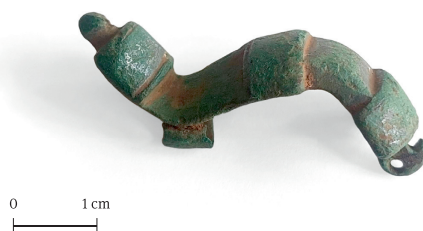
Fig. 2. Saka crossbar fibula (no. 85).

Artefacts from the Middle Ages (1200/1250–1558 AD) and from the Modern Period (1558 AD onwards) are also numerous. Most of them represent ornaments, dress accessories and small everyday items. A more noteworthy discovery was made in Äherdi (no. 215), where an odd