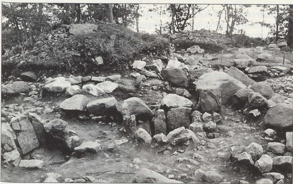
Photo 2. Pits No 1, 3, 4, 5 and the southern wall of the probable cult site at Tõnija (view from W). Foto 2. Tõnija arvatav kultuskohi koos aukudega nr. 1, 3, 4, 5 ja lõunapoolne müür. Pildistatud läänest.

The bottoms of the pits were covered with stones that had collapsed from the upper parts of the wall-lining; the rest of the pits were filled with almost stone-