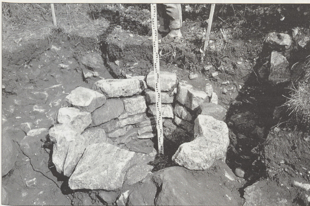
Photo 1. Pit No 1 with stone walling as in a well.

The construction of the stony platform resembled that of the tarand -graves, i. e. a rectangular enclosure surrounded by a wall of bigger stones was filled with smaller stones. The southern wall of the construction, built of big boulders, had survived particularly well. Judging by several bigger granite stones, a similar wall parallel to the southern one had been situated 7 m to the north. Its poorer state of preservation can be explained by the presence of the cellar nearby. Beside and between the boulders of the southern and northern walls a great quantity of badly burnt fist-sized stones was recorded. Single potsherds and fragments of animal bones among the burnt stones suggest that the used heating stones of ovens were deposited here. The western wall of the construction, consisting mainly of limestone, was quite poorly preserved as well, perhaps because of the later road nearby. The foundation stones of the western wall were clearly at a lower level than these of the southern and northern walls, which can be explained by a lower terrace in the western end of the platform. A NE-SW oriented wall, about 3 m long, of somewhat smaller granite stones was recorded between pits No 1 and 4. It was marked the boundary between the layer of small limestone slabs to the north and west, and the layer of burnt heating stones to the south and east of it.