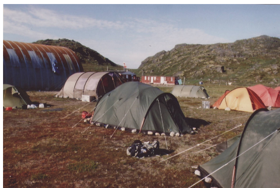
Fig. 3. The Midgaard base camp is surrounded by hills with dwarf shrub heaths rich in lichens.