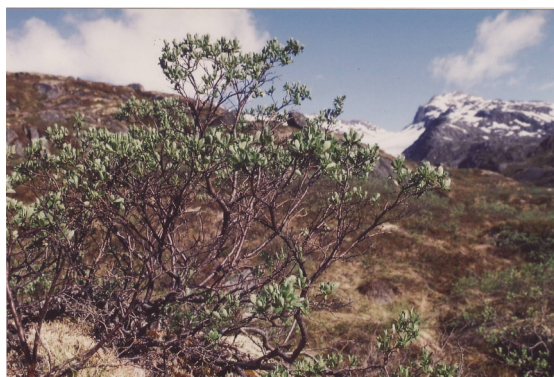
Fig. 4. Up to more than two meter high shrubs of Salix glauca carrying a characteristic corticolous lichen vegetation near the Midgaard base camp.

cornuta , C. crispata , C. ecmocyna , C. floerkeana , C. macroceras , C. mitis , C. sulphurina , Flavocetraria cucullata , F. nivalis , Icmadophila ericetorum , Nephroma arcticum , Ochrolechia alaskana , Peltigera scabrosa , Stereocaulon alpinum and S. paschale are also relatively common. The more sporadic occurrence of Peltigera kristinssonii and P. neckeri is noteworthy. Both species are comparatively rare in oceanic areas (Vitikainen, 1994). Patches with Arctocetraria andrejevii , A. simmonsii , Cetrariella delisei and Cladonia trassii occur in moist places in the heaths. Arthrorhaphis citrinella , Baeomyces rufus and Candelariella canadensis are pioneers on bare soil.