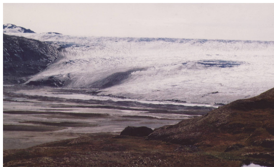
Fig. 2. View of the border zone of Frederikshåbs Isblink from a stony ridge near the camp.