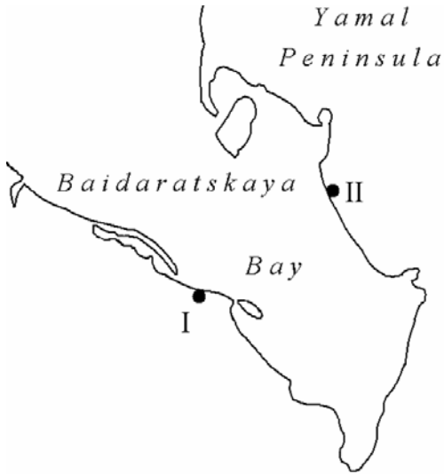
Fig. 2. Investigated localities.