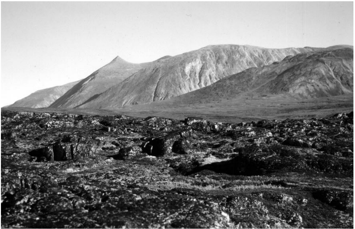
Fig. 2. Gneissic rocks and fell-field patches just north of Saqqaq. The rocks hold a dense vegetation of epilithic lichens dominated by different species of Umbilicaria and microlichens with black thallus, for example, Orphniospora moriopsis . "Livets top" and other mountains are seen in the background.

Investigations of the lichen flora of the surroundings of Saqqaq and Qeqertaq were carried out by the author in August 2002 and from late July to early in August 2003, respectively. Lichens were collected at numerous sample plots around Saqqaq and all parts of the island Qeqertaq Ø were also studied. The collected material, a total of 440 lichen specimens, was studied with Zeiss light microscopes. Selected specimens of Bryoria , Cladonia and Stereocaulon were identified by means of HPTLC. The material is deposited at the Botanical Museum, University of Copenhagen (C).