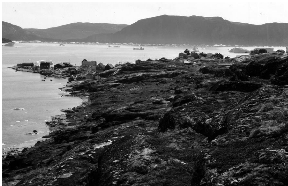
Fig. 3. A mosaic of dwarf shrub heaths with Cetrariella delisei and Cladonia trassii and low gneissic rocks covered with black lichens characterize the landscape north of Qeqertaq.