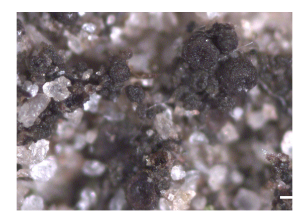
Fig. 2. Leptogium biatorinum , thallus with apothecia. Bar 0.5 mm.

iting calcareous soil or rocks (Jørgensen, 2007).