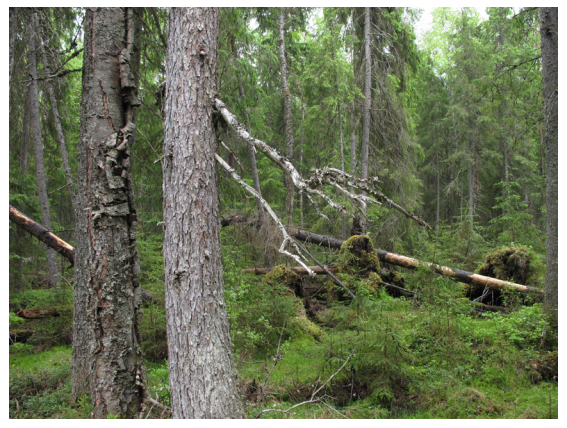
Fig. 4. Habitat of Nephromopsis laureri in birchspruce-pine forest in Novgorod Region, Khvojninsky district, ca. 21 km NWW of Zhiloy Bor.