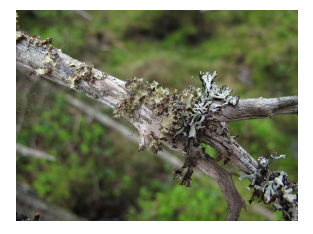
Fig. 3. Nephromopsis laureri on branch of old spruce.

Most of the species presented above are typical for European boreal forests and (except