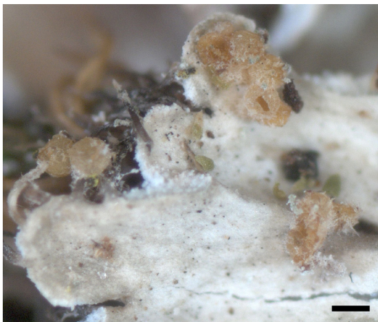
Fig. 3. Nectriopsis physciicola (LE 261005). Ascumata habitus. Bar = 200 \mu\text{m} .

Notes – Examined specimen fits in most features the original description (Earland-Bennett et al., 2006), except of the colour of the ascomata and the size of the ascospores. The ascomata are not pinkish but pale orange to clay-buff (Fig. 3). The ascospores are on an average somewhat longer than in the original description, (16.7\text{--}18.4\text{--}21.4\text{--}22.9) \times (5.4\text{--}5.9\text{--}6.7\text{--}7.0) \mu\text{m} , l/b = (2.7\text{--}2.9\text{--}3.5\text{--}4.0) ( n = 46 , in water) vs. (14\text{--}14.5\text{--}18\text{--}22.5) \times 5.5\text{--}8 \mu\text{m} . So far the species was known from several collections in Spain