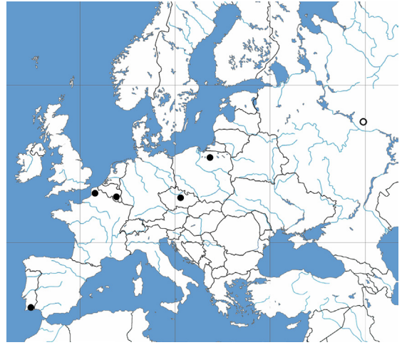
Fig. 2. Known distribution of Gyalidea minuta according to Kubiak & Maliček (2012), amended. The locality in Kerzhenskii Reserve is marked with .

Because of their very small size, inconspicuous appearance and short life cycle, members of the genus Gyalidea are easily overlooked in the field. Five species of this genus have been noted in Russia, many of which are extremely rare with only single localities: G. asteriscus (Anzi) Aptroot & Lücking, G. diaphana (Nyl.) Vězda, G. fritzei (Stein) Vězda, G. lecideopsis (A. Massal.) Lettau and G. scutellaris (Bagl. & Carestia) Lettau (Urbanavichus, 2010; Melechín, 2016). All these