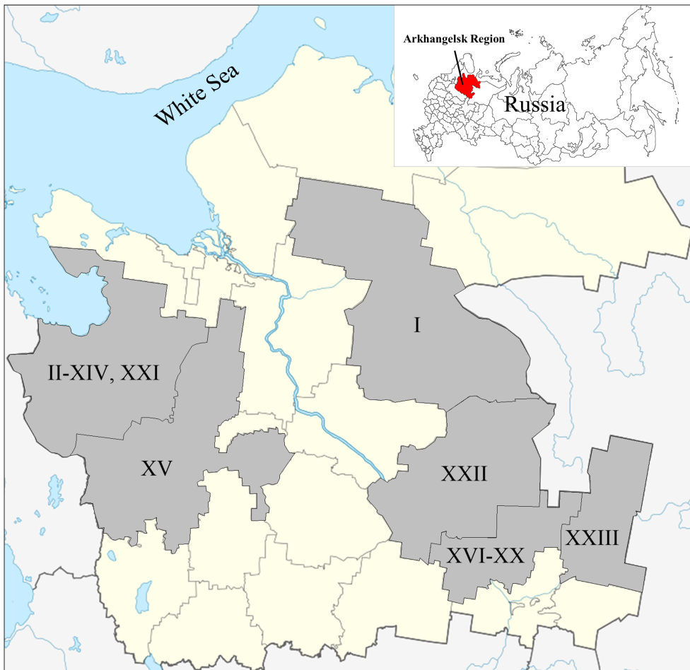
Fig. 1. Collection sites (I–XXIII, detailed data are presented in Appendix 1).

the arithmetic mean and SD the corresponding standard deviation, followed by the number of measurements (n). The length/breadth ratio is indicated in the same way. The lichen substances of Micarea species were identified by a standard technique of high performance thin-layer chromatography (HPTLC) in the Laboratory of Lichenology and Bryology of Komarov Botanical Institute of RAS (St. Petersburg) using solvent system C (Orange et al., 2001). The crystalline granules of Micarea species were investigated by using a compound microscope with polarization filters. The cited specimens are deposited in the Herbarium of Petrozavodsk State University (PZV), Komarov Botanical Institute RAS (LE) and Komi Research Centre (SYKO).