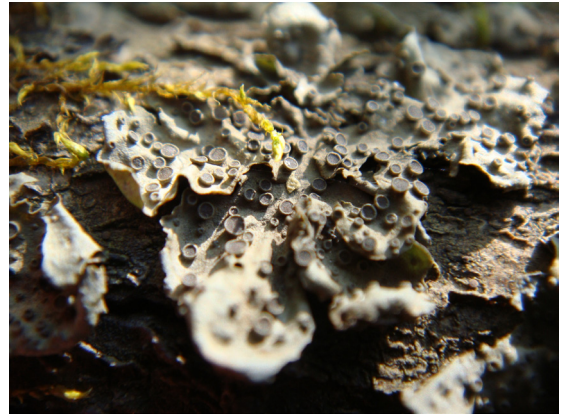
Fig. 2. Fertile thallus of Leptogium rivulare (Ach.) Mont. on bark of black alder.

! LEPTOGIUM RIVULARE (Ach.) Mont. (Fig. 2) – on bark of black alder, XVIII: 52, SYKO. RA. – This is a rare species in Russia. It is included in the global IUCN Red List of Threatened Species in the category Near Threatened (Randlane, 2015). Distribution in Russia: Murmansk Region (Halonen, 1996), Republic of Komi (Pystina et al., 1999, Pystina 2001; Degteva, 2019), Republic of Mari El (Bogdanov, 2015; Bogdanov & Urbanavichus, 2008), and Sverdlovsk Region (Paukov & Teptina, 2012, 2013).