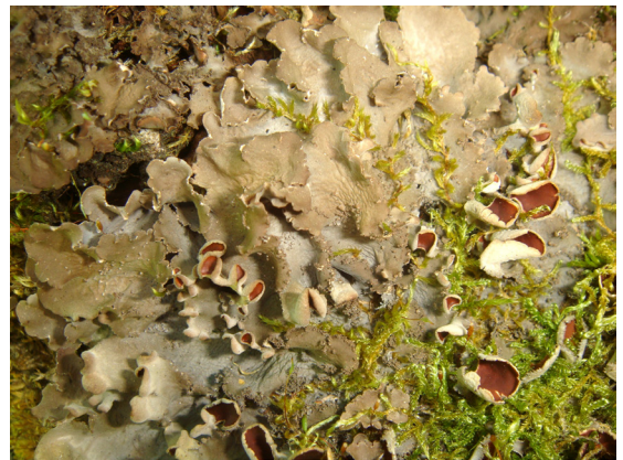
Fig. 3. Fertile thallus of Nephroma helveticum Ach. on bark of black alder.

! NEPHROMA HELVETICUM Ach. (Fig. 3) – on bark of black alder, XXII: 58, SYKO. RA. – Distribution in neighboring territories: Republic of Karelia (Fadeeva et al., 2007), Republic of Komi (Degteva, 2019), Murmansk Region (Konstantinova et al., 2014), and Vologda Region (Konechnaya & Suslova, 2004).