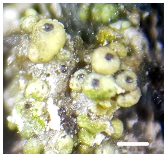
Fig. 5. Fertile thallus of Protothelenella leucothelia (Nyl.) H. Mayrhofer & Poelt on stone with thin soil layer. Scale: 0.5 mm.

! PROTOTHELENELLA LEUCOTHELIA (Nyl.) H. Mayrhofer & Poelt (Fig. 5) – on stones with thin soil layer, II: 22, PZV, RA. – A rare arctic-alpine species. Distribution in neighboring territories: Murmansk Region (Urbanavichus et al., 2008), and Republic of Komi (Hermansson et al., 2006).