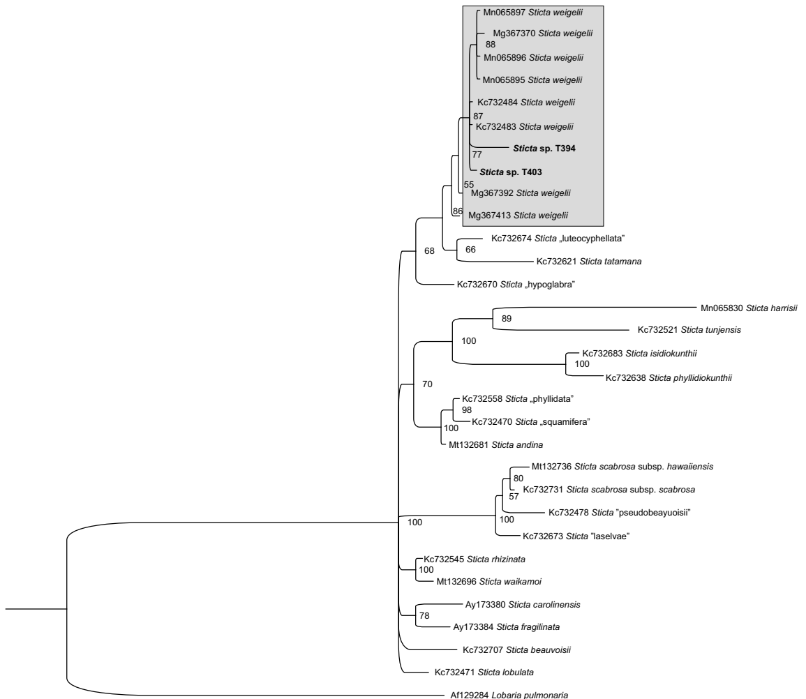
Fig. 1. Phylogenetic relationships of Sticta weigeli morphodem based on Bayesian analysis of nucITS rDNA dataset. Posterior probabilities values are shown near the internal branches. GenBank accession numbers of sequences downloaded from GenBank are listed on the tree with species names. Clade of S. weigeli is highlighted. Specimens newly sequenced for this study of S. weigeli are in bold. KC732471 Sticta sp. * undescribed species provincially called Sticta lobulata in Moncada (2012) and Moncada et al. (2014, 2020).

Sequences of two specimens of S. weigeli s.str. (MZ292976 and MZ292977), as defined by Mercado-Diaz et al. (2020), were obtained from material collected in Bolivia. In the phylogenetic tree (Fig. 1), they clustered within the clade