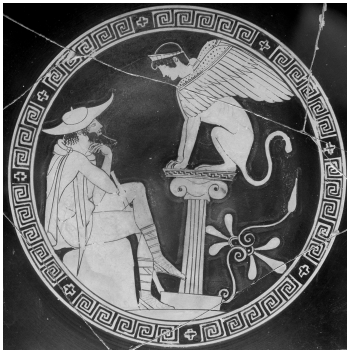
Attic cup: Oedipus and the Sphinx 2

That the myth of Oedipus became known as a tragedy was only one possibility; the alternative, that it be instead considered a comedy, was likewise a completely realistic line of development. This is referenced by Sophocles' contemporary comedic kylix painting, currently displayed in the Vatican Museum, which depicts Oedipus flirting with a feminine sphinx and is covered with many joyous phallic symbols that one could hardly call morbid.