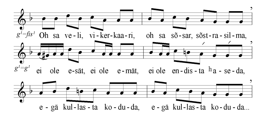
Example 4. Two-line melody. A fragment from a lyrical song Vara vaeslapseks about an orphan's life, sung by Ann Jõeste (1882–1968) from Karksi parish.<sup>19</sup>

The melody 4R(1) has the length of a single line (Example 2). Every line is followed by a refrain that usually consists of one or two words. Type 4R(1) is one of the most frequently occurring melody types in Karksi. In the archived material, we found 54 song variants for this melody, sung by 12 performers. In 47 instances these melodies here are associated with specific seasonal group activities – the melody appears 19 times in harvest songs and 28 times in calendar ritual songs. Songs of this kind may have had magical connotations, but they also served as entertainment.