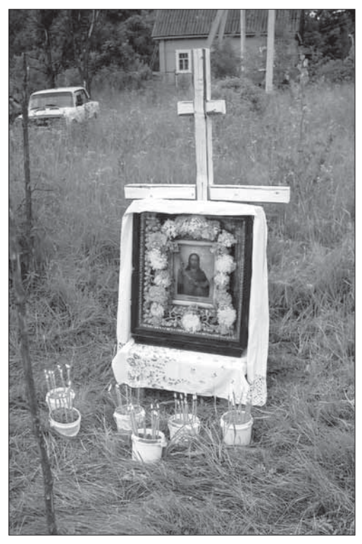
Photo 4. Wooden cross and icon at the site of the former village chapel in Luutsa where the village feast was celebrated. Photo by Madis Arukask 2003.

for the most part different as instead of a prayer meeting and holy procession the central place is acquired by the lay formation, a kind of gala led by the hostess of the local museum. The programme has included speeches by district officials and the village elder, lectures about history of the village and its inhabitants, performances of villagers, folklore groups and invited musicians, as well as common memorial procedures to commemorate losses in war and repressed community members. In a somewhat symbolical sense the religious aspect of the event was indicated in 2003–2004 by the erection of a temporary wooden cross on the former site of the village chapel where an icon was placed and candles were lit in the course of memorial procedures<sup>43</sup>. Nevertheless, the local community has opposed organisers' initiatives to ask representatives of the clergy to participate in the event. That obviously reflects results of Soviet anti-religious policies and present-day relationships between majority of villagers and the local clergy.