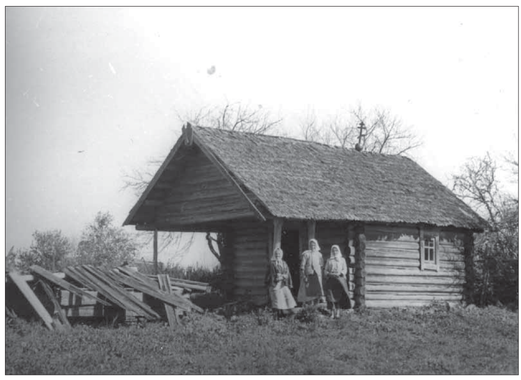
Photo 1. Village chapel in Pihlaala where the feast of nastassia was celebrated. Photo by Erik Laid 1942. VE VII (41).

laala (Pillovo/Πμλλοδο) was well known for the annual feast of nastassia ('St. Anastasia'; 29.10/11.11)<sup>22</sup>, which was celebrated in the local chapel of St. Anastasia at the verge of the village. Relying on many accounts in folklore collections, this feast was celebrated by the inhabitants of many close villages who came on nastassia to the chapel and a holy spring next to it.