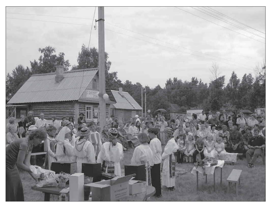
Photo 5. Luutsa village feast in 2004. Participants of the feast follow the performance of the local folklore group.

ertoire. Informal parts included games between the kin groups and the visit of tšudi (uy\partial u) , the group of oddly dressed and masked villagers, representing traditional institution of mumming that was re-actualised spontaneously by elderly villagers.