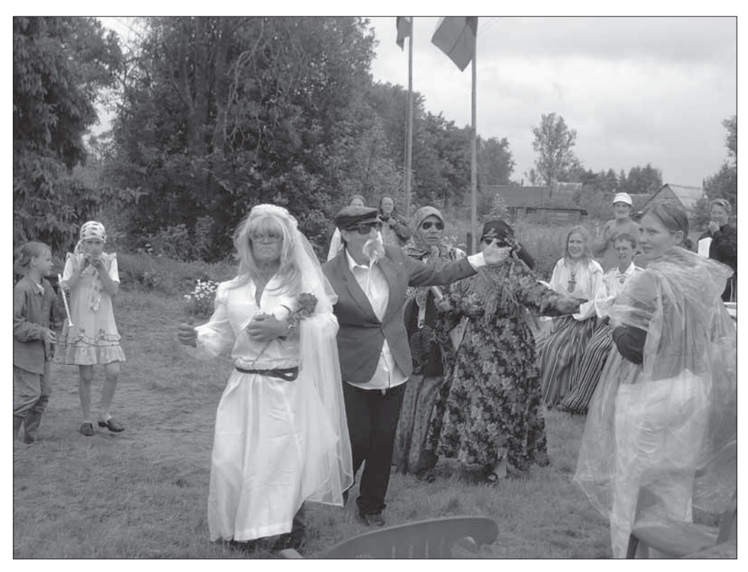
Photo 6. The visit of tšudi at the Luutsa village feast in 2004.