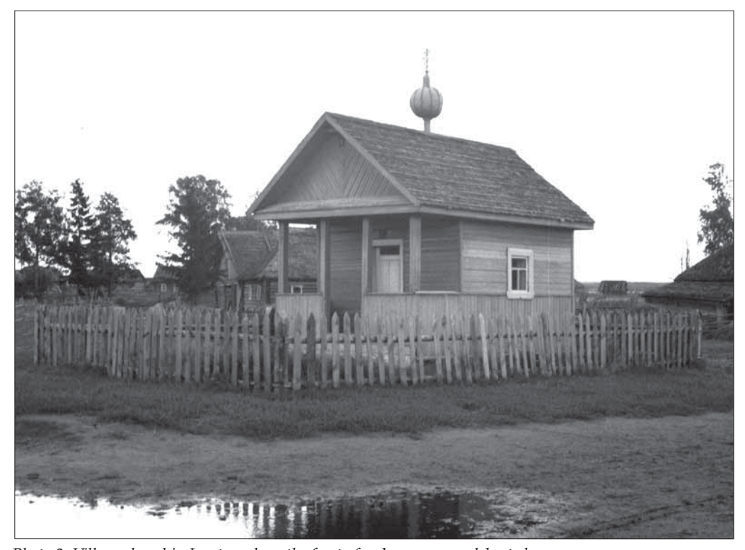
Photo 2. Village chapel in Luutsa where the feast of pokrova was celebrated. Photo by Gustav Ränk 1942. ERM, Fk 1049: 32.

with the churches in the parochial centre Kabrio ( Koporie/Konopbe ). The patron saint day of the parish church was tuli-mārja (15./28.08) while the other church, situated in the ruins of a medieval castle, celebrated the feast day on spāssa (1./14.08). Importance of the lastly mentioned holyday is reflected in microtoponymy – people from nearby villages and pilgrims valued on that day water from spāsā lähe ('Spring of the Saviour') that was located next to pāsimātši ('Hillock of the Saviour'); in addition sanctity of this complex near churches was marked with the icon of Virgin Mary (Ariste 1969: 111, 115). Holy processions were carried out on these feasts from one church to another and stops were made next to the holy spring and hillock. In the nearby Votian village Itšäpäivä ( Icipino/Иципино ) tuli-mārja was celebrated also as village feast where festivities were carried out in the local chapel. A village feast, including brewing beer and activities in the chapel, was celebrated in Itšäpäivä also on taxvi-jūrtši (26.11/9.12).