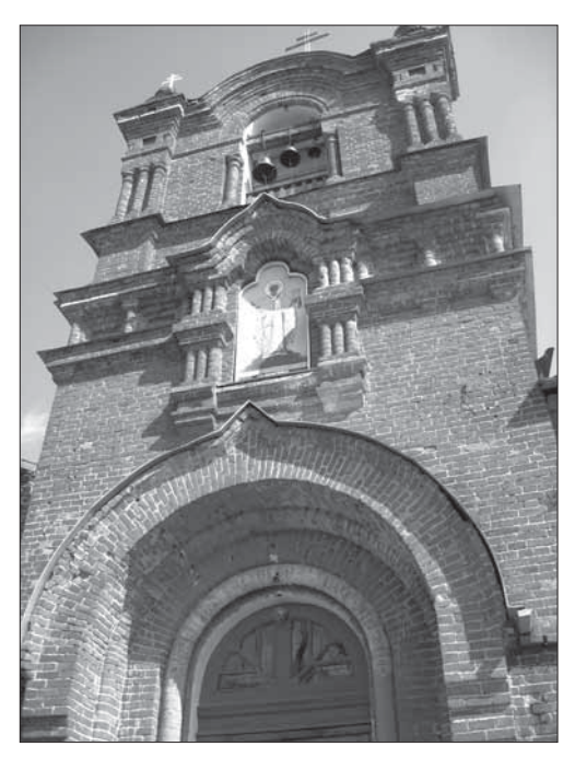
Photo 3. Parish church dedicated to St. Nicholas the Wonderworker in Kattila.

in Jõgõperä was χlāri (< Φλορ u Λαβρ 'Sts. Florus and Laurus'; 18./31.08)<sup>32</sup> – a typical feast day for the villages with churches as the traditions of this day included consecration of horses with holy water near the church (cf. Öpik 1970: 110, 156–157). A third important feast in Liivtšülä and Luutsa villages was celebrated on pokrova (1./14.10) which was the patron saint day of the village chapel in Luutsa. On that day, too, a holy procession was carried out from the parish church to the chapels in these villages<sup>33</sup>. Well-known were also in Vaipooli villages some of the feast days in nearby Izhorian villages: spāssa (1./14.08) in Laukaansuu (Ostrov/Ocmpoe) and nastassia (29.10/11.11) in Pärspää (Lipovo/ Липово). People from several neighbouring villages attended the feast in Pärspää as the chapel in this village - alike in Pihlaala - was visited in order to guarantee good luck for their sheep. On spāssa, holy procession from the Jõgõperä church was carried out to the Lauga River where the priest consecrated the water of Lauga and all the participants swam in the river.