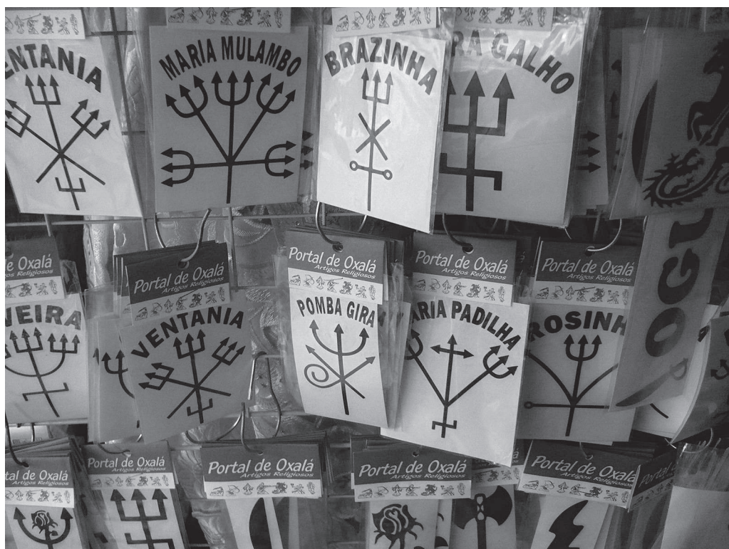
Photo 7. Pontos riscados – stickers sold in ritual shop, Diadema.

shops, on many newspaper stands and in supermarkets in urban areas and were used by Umbanda people as well as by many others. These bags and boxes carry the name of the herb or alternatively only the purpose of its use, such as “open the pathway” ( abre caminho ), “break the witchcraft” ( quebra feitiço ), etc.