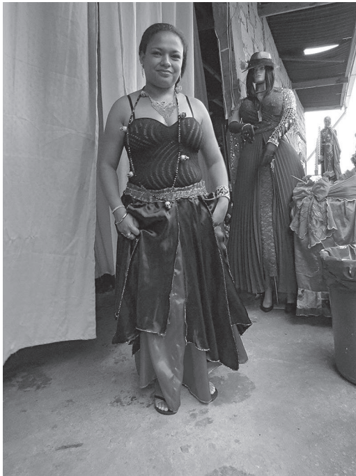
Photo 1. Umbanda medium with Pomba Gira's (female Exú spirit entity) 1 dress and guia necklace.

today in Southeast Brazilian Umbanda houses, the most crowded ritual gatherings ( gira ) 3 are those in which different Exús are interacted with, due to complicated situations surrounding health, wealth or love. These are called rituals of the left side ( esquerda ), in which male Exús, female (Pomba Giras), and child Exús (Exú Mirims) act, as well as some other 'spirit entities of the right side', known as está mais pra esquerda , i.e. capable of working in the left. 4 For Umbanda practitioners ( umbandista ) 5 the Exús are of all races, ethnic origins, social backgrounds and nationalities that have existed in Brazil throughout its history. They are known especially as people who lived on the margins of society as petty criminals, gamblers, prostitutes, and homeless children (see Prandi 2005: 81–82; Hayes 2011: 3–4), but also according to many Umbanda practitioners, as respected lawyers, politicians and doctors. Despite different social backgrounds, the common factor is that at