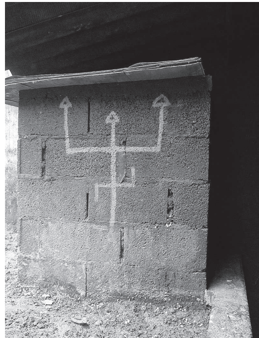
Photo 4. The sidewall of Casa de Exú with Exú Ventania's ponto riscado.

After this initiation into Candomblé and after years of devotion she had felt that there was something missing, her