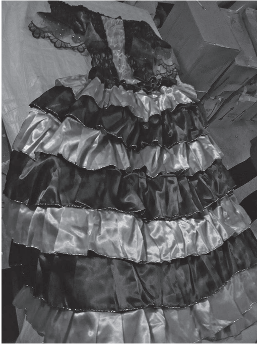
Photo 6. Female Exú Sete Saias dress sold in ritual shop, city of Diadema.

Through these objects the spirit entity's personality and habits become recognisable. In other words, these materials are part of the objectification of the spirit entities the developing medium goes through. The spirit entities appear at first in dreams, in visions, as voices and as intuitive knowledge. They are part of their medium's sub-conscious and during the evolvement process they become recognised as separate beings, or ontologically significant others, as I will point out further on in this article.