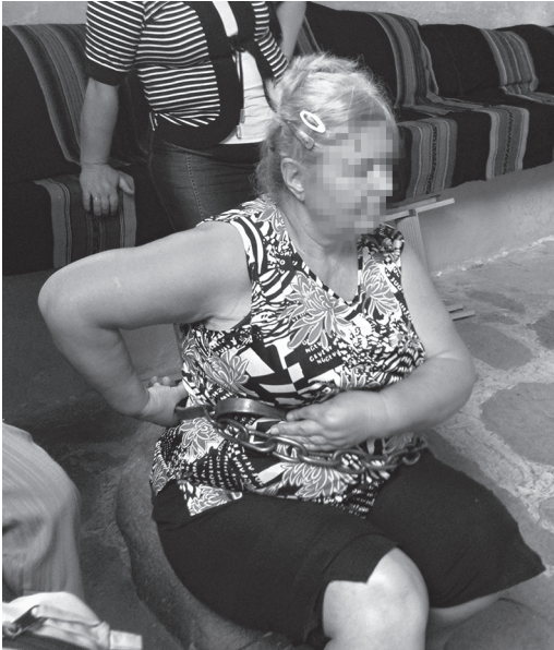
Photo 1. A woman pressing the healing chain against her back in the monastery church of SS Kosmas and Damian, in Kuklen.