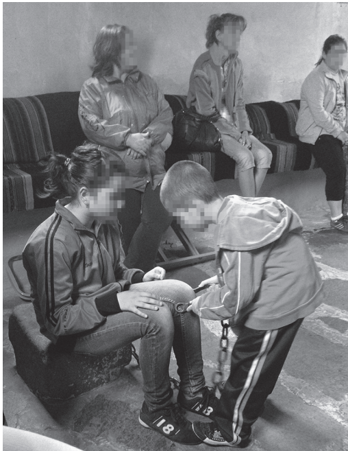
Photo 2. A girl and a boy imitating healing procedures of the grown-ups in the monastery church of SS Kosmas and Damian, in Kuklen. June 30, 2013.

upwards. "Could you stop all that clanging while the service is in progress?" the candle seller leans out of her stand at the opposite end of the narthex and snaps at one of the people.