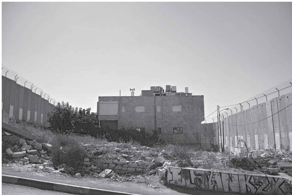
Photo 1. Home of the Anastas family surrounded on three sides by the Wall.

This description provides a few insights onto the importance of incorporating a new materialist interpretative framework through Latour's concept of assemblages. Instead of describing the Wall through adjectives such as 'ugly', 'tall', 'solid', she depicts it as strangling her, that is, she attributes to the Wall an action, that of choking. Already, in this first observation the materiality of the Wall, that is, its physical presence, does not appear inanimate, but she describes it as possessing the same agentic power as a human subject. Secondly, if we acknowledge that the Wall has agency, what does it mean that it strangles someone? After all, the Wall might have been anthropomorphised, but it still does not have actual hands. So what is it about the Wall that strangles?