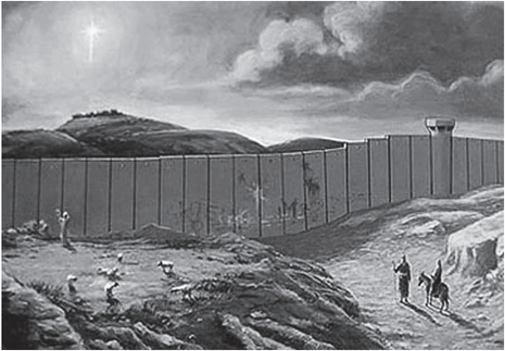
Figure 2. Picture of Mary and Joseph blocked outside Bethlehem by the Wall allegedly painted by graffiti artist Banksy (2015).