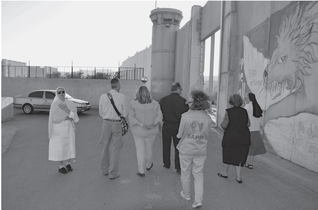
Photo 2. The Elizabethan nuns, Abuna M., an EAPPI volunteer, and Christians recite the Rosary by the Wall next to the entrance of Checkpoint 300. The Checkpoint's watchtower looms over it.

printing, soldiers who check IDs – interconnect with the dimension of the Christian practice of the Rosary recitation. As a result, among the above-cited human and non-human actants, we discover also the presence of praying nuns, pilgrims, rosary beads, the Our Lady of the Wall icon, Hail Maries, Salve Regina , and prayers to achieve the miracle of making the Wall fall. Consequently, the Wall understood and constructed in order to guarantee security to the Israeli inhabitants and experienced as a technology of occupation by the Palestinians, when understood as an assemblage reveals the development of a ritual landscape that is both part of its assemblage and at the same time developed in opposition to its presence.