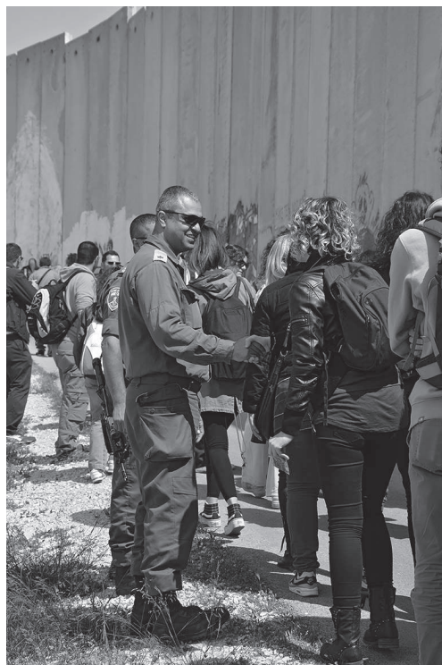
Photo 7. Pilgrims shaking hands with the soldiers monitoring the Holy Mass at Our Lady of the Wall.

at Our Lady of the Wall. As I mentioned above, the religious activities that have sprung from the presence of the icon have become, for the pilgrims who visit Palestine, a way to familiarise themselves with the political situation in this land as well as a solicitation for God's intervention to bring peace and justice. On the morning of April 10, the great number of pilgrims aroused suspicion among the Israeli soldiers guarding Checkpoint 300, and they immediately closed the gate. They followed the pilgrims near the icon and asked the priests for explanations. In response the priests replied that they were not doing anything wrong, that they just wanted to pray at Our Lady of the Wall and they would pray for them as well. The soldiers replied that if they wanted to pray, they would have to do so inside the gates of the monastery of the Emmanuel and not by the Wall. The argument lasted sometime, but in the end the priests agreed just to move