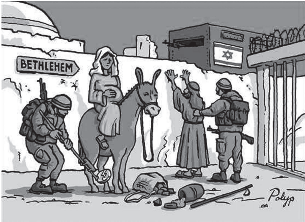
Figure 3. Mary and Joseph inspected at the Checkpoint before entering Bethlehem (Polyp).