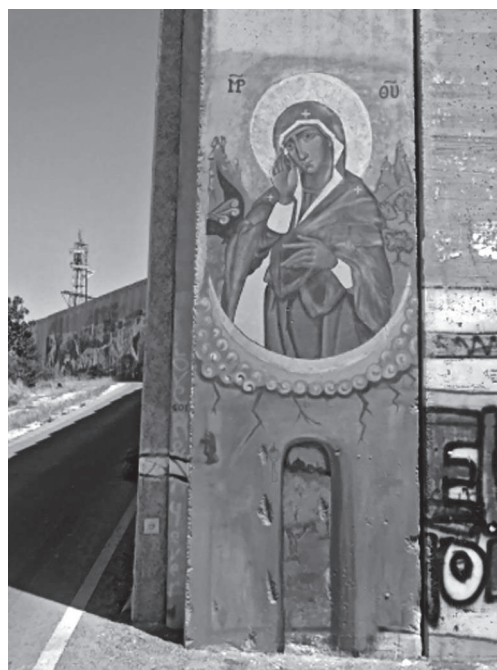
Photo 4. Icon of Our Lady of the Wall painted in 2010 by iconographer Ian Knowles.

The peculiarity of the subject chosen for the icon could refer on the one hand to the Book of Revelation (12:1–5) in which “a pregnant woman clothed with the sun and the moon under her feet, and an enormous red dragon with seven heads and ten horns and seven crowns on its heads” is mentioned (Stadler and Luz 2015: 134). This hypothesis can be corroborated by the fact that a large serpentine dragon graffiti appeared on the Rosary’s Wall route before the Wall was repainted grey for the arrival of Pope Francis in 2014. On the other hand, there could be a connection between the subject of the icon and the increasingly popular images divulged on social media on the internet by activists and supporters of the Palestinian cause. Specifically, one painting, allegedly created by famous British graffiti artist Banksy, portrays a pregnant Mary with Joseph. In this image Mary cannot give birth in Bethlehem because the Wall