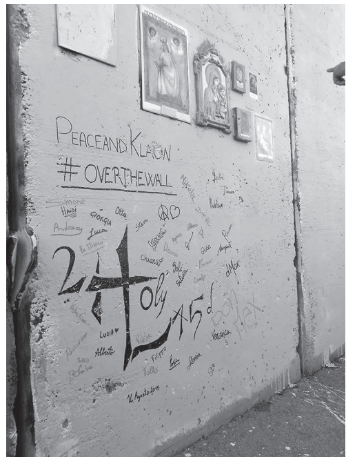
Photo 5. New icons added by Pilgrims next to Our Lady of the Wall.