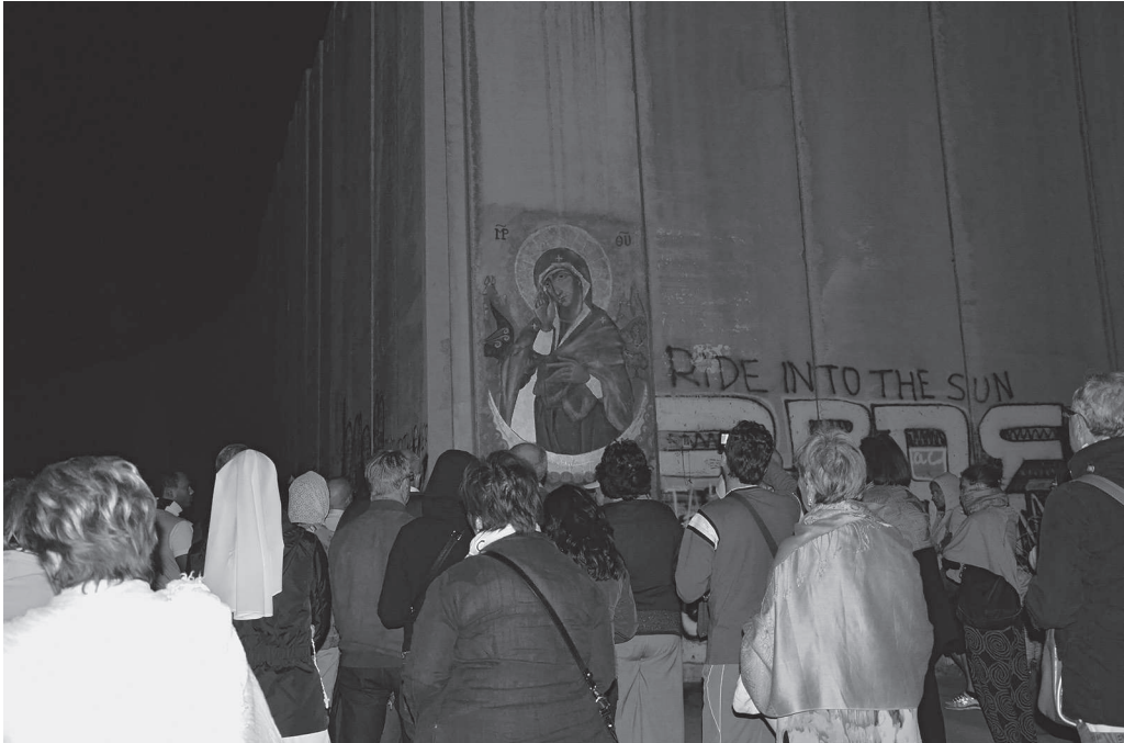
Photo 3. Pilgrims conclude the recitation of the Rosary through the singing of the Salve Regina in Latin while standing in front of the Our Lady of the Wall Icon.

The lack of a strong Palestinian presence is linked to the fact that any type of participation in activities suspected to be connected to political protests or uprisings often leads to the future denial of a permit to enter the State of Israel. Already the Christians benefit from the infrequent permits allotted almost exclusively in conjunction with major religious festivities and any suspicion of political dissent may jeopardise allocation, preventing them from visiting family and friends living on the other side of the Wall.