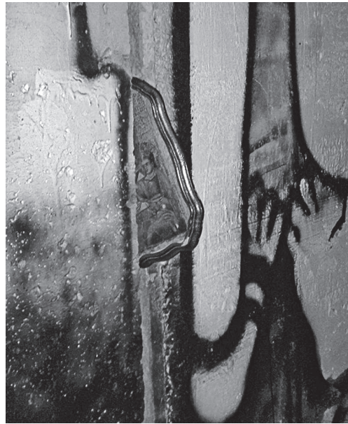
Photo 6. The San Luca Icon pushed in between the Wall's cement slabs near the Icon of Our Lady of the Wall.

we uncover the presence of a ritual landscape that, through a decade of unflinching prayer, has been developing into an actual shrine that is increasingly expanding through the posting of new religious icons. When analysing this particular Wall through the assemblage framework, we do not only realise that it cannot be understood as a mere inert cluster of concrete slabs, but also that because of the agency it exercises on the population, a ritual landscape has developed along its route as a battlefield to voice the dissent of a particular religious group: the Christian minority. In turn, the ritual landscape becomes an integral part of the Wall assemblage. We have seen how its formation gathers both human and non-human agency, such as Rosary beads, the colours and symbols adopted in the icon of Our Lady of the Wall, the addition of other Marian icons, the physical presence in this militarised area of the praying pilgrims, nuns, volunteers, activists, and a few local Christians, the chanting of the Hail Marias, the singing of the Salve Regina , and as discussed in the next section, the Eucharist, the chalice, a portable altar, and the songs and guitars adopted during the celebration of Holy Mass.