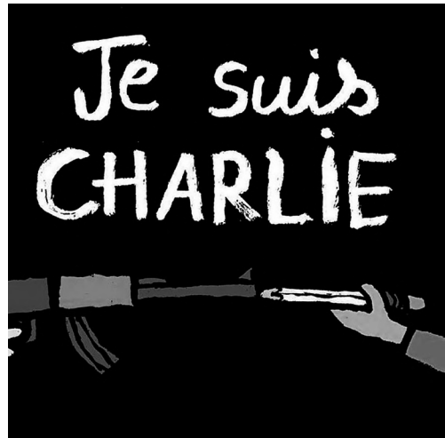
Figure 2. Je Suis Charlie drawing (H.KoPP 2015).

When we analyse the mourning rituals performed in the digital mediascape after the Charlie Hebdo attacks we need to acknowledge a close interplay between the physical and the digital ritual practices of mourning. In mourning practices, Paris was constituted as the ritual centre of the events. The digital mediascape was filled with news and social media images of people gathering in silent demonstrations on the streets, squares, and plazas to mourn and to pay respect to the victims of the attacks. I consider taking and sharing these pictures in the digital mediascape a ritual practice demonstrating solidarity and compassion for the victims of the attacks. As Roncin put it “we’re trying to feel a community [...]. It is very reassuring to be all together whenever there is something horrible happening.” (Devichand 2016) Typical of the digital mediascape, these images were produced by professional and ordinary media users alike and followed a repetitive pattern of symbolic communication, crystallised around the message “Je suis Charlie”.