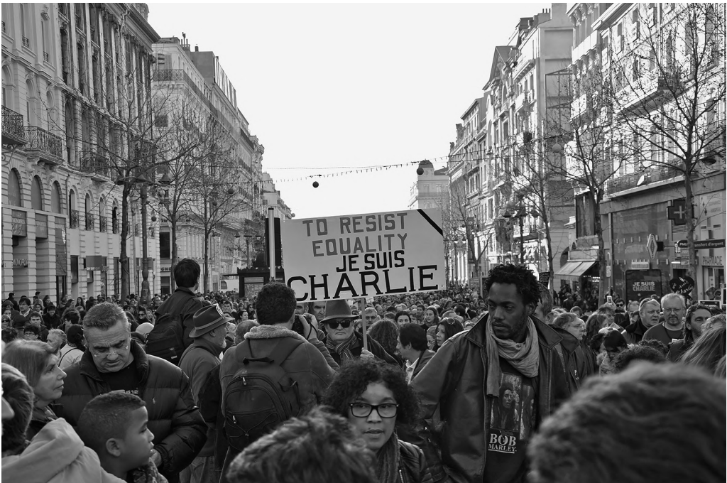
Photo 2. Ritual march in Marseille.