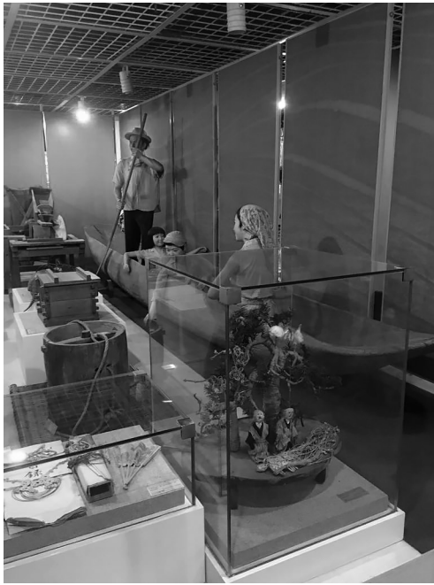
Photo 7. Work and art: exhibiting the everyday life of the Japanese community.

The focus of the exhibition is the spectrum of everyday life in the Japanese community since the first arrival of 790 immigrants aboard the Kasato Maru in 1908. It starts with the experience of alienation, with habits, food and everyday items totally different from those the immigrants had been used to. Throughout the exhibition the creativity of new immigrants was stressed, for example the invention of new tools, developing new agricultural products, building ground-breaking companies, etc. Hard work and striving for innovation were leit-motifs throughout the display, binding different themes. In addition, initiatives in cultural life and developing Japanese schools were covered. The Japanese community was deprived of some of their rights during World War II, and a section is dedicated to the painful experiences of that loss at the exhibition. The section covers the closure