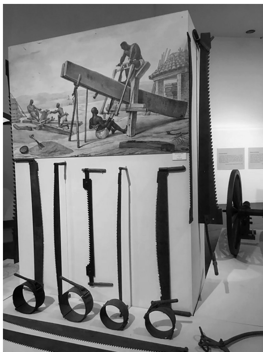
Photo 5. Telling the story of the creative everyday under slavery in the Museum of AfroBrazil.

struction of black people’s cultural history in order to promote their self-esteem” (ibid.: 51). It could be said that Araújo, the curator and director of the museum, has been very successful with the museum concentrating on the construction on Afro Brazilian cultural history and heritage. During our visit a temporary exhibition was opened (titled Design e Tecnologia no Tempo da Escravidão ), which was curated by Araújo and dedicated to African material culture. At the centre of that display were the artefacts that were used in everyday life and on the plantations during slavery. The temporary exhibition stressed the creative contribution of slaves as the avant-garde of everyday design concepts.