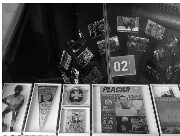
Photo 9. An insight into the Museum of Football.