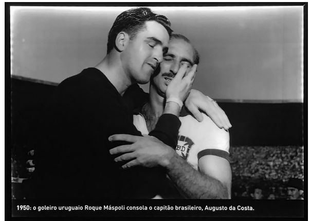
Photo 8. Trauma, loss and consolation: Brazil’s defeat by Uruguay in 1950. Photo by Ene Kõresaar.