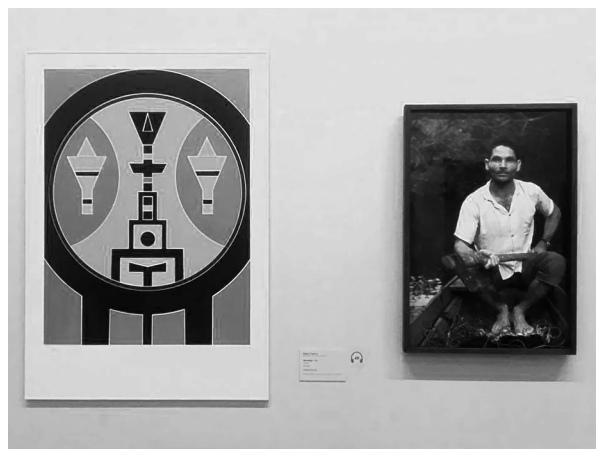
Photo 4. Manual work, nature and miscegenation: a pedagogical representation of constructing Brazilian identity in the 20th century.

to Brazil” (exhibition text) by incorporating the idea of cultural diversity: “mixed-race rustic folk” (exhibition text) into the centre of an identity project.