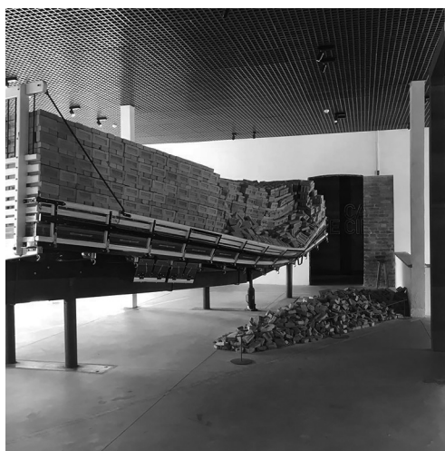
Photo 1. Installation by Nuno Ramos at the entrance to the Immigration Museum's permanent exhibition.

However, the exhibition itself stresses Brazilianness (all are Brazilians) rather than trauma. To be sure, trauma is not entirely absent in a space dedicated to topics such