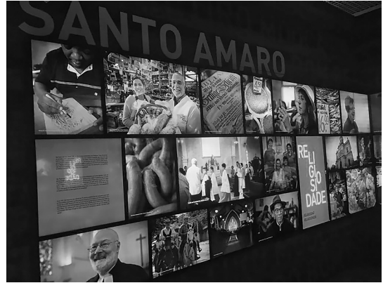
Photo 3. The making of multicultural São Paulo at the Immigration Museum.

The exhibition uses many innovative solutions that really help to mediate the (im)migration stories. Oral history is cleverly integrated into the exhibition: the experiences of immigrants are staged in several separate 'boxes' so that many visitors can listen to the stories simultaneously. In addition, in one box at least two people can have the same experience at the same time. Furthermore, the immigration stories that are told are represented thematically, so one can choose a topic to listen to, such as travel across the Atlantic or adapting to new food in the southern hemisphere. The museum also presents contemporary migration stories and continues to actively deal with current processes, showing the diversity of today's São Paulo.