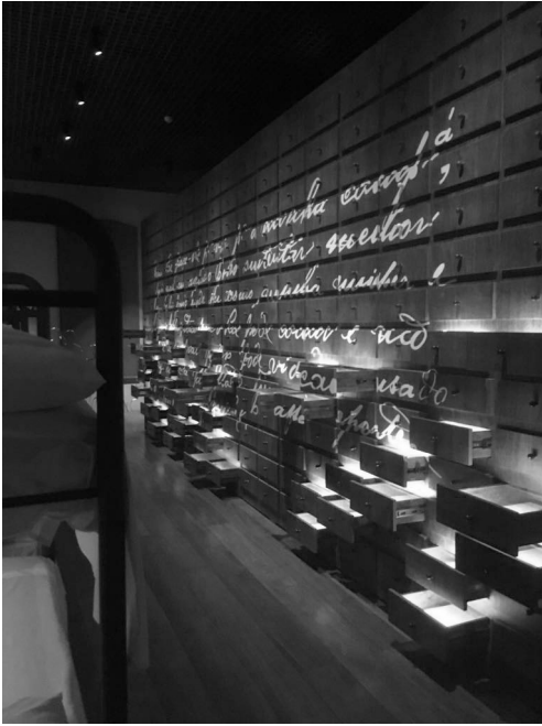
Photo 2. Letter boxes: exhibiting the fears and longing for home of immigrants in a former dormitory. Immigration Museum.

The exhibition uses many innovative solutions that really help to mediate the (im)migration stories. Oral history is cleverly integrated into the exhibition: the experiences of immigrants are staged in several separate 'boxes' so that many visitors can listen to the stories simultaneously. In addition, in one box at least two people can have the same experience at the same time. Furthermore, the immigration stories that are told are represented thematically, so one can choose a topic to listen to, such as travel across the Atlantic or adapting to new food in the southern hemisphere. The museum also presents contemporary migration stories and continues to actively deal with current processes, showing the diversity of today's São Paulo.