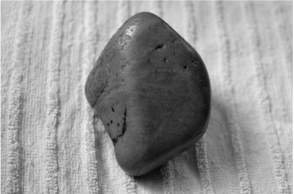
Photo 7. The healer Gan'zada's pebble, which she used in magic healing.