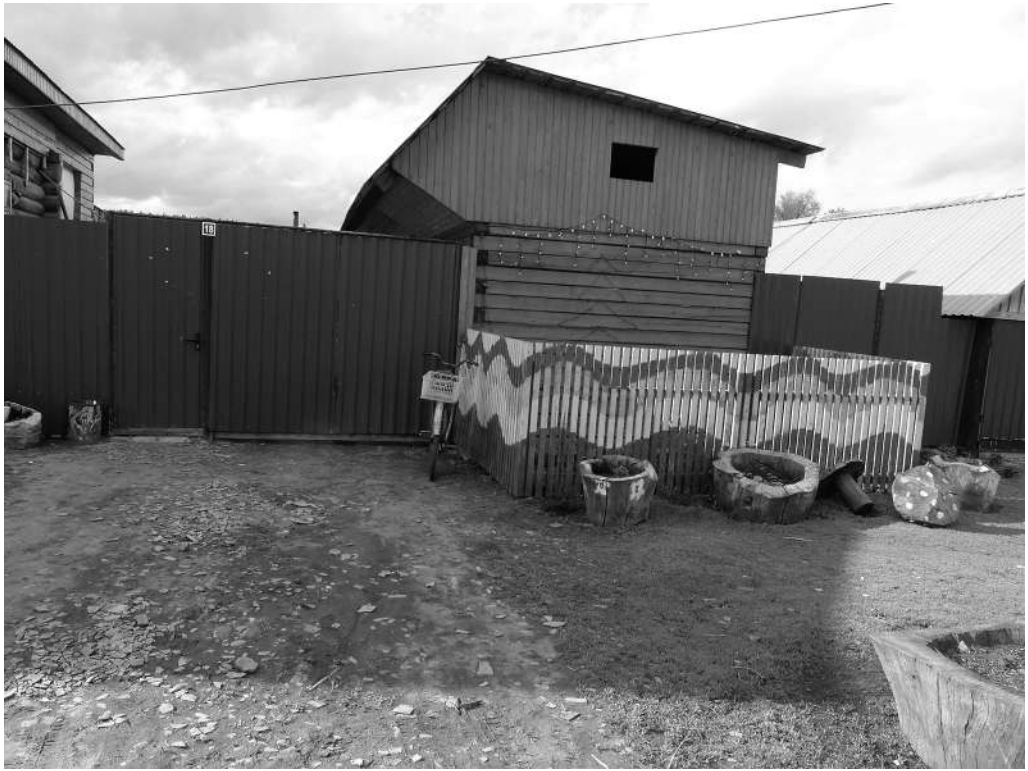
Photo 5. The single room where the healer Nadezhda receives her visitors. Photo by Eva Toulouze, 2017.