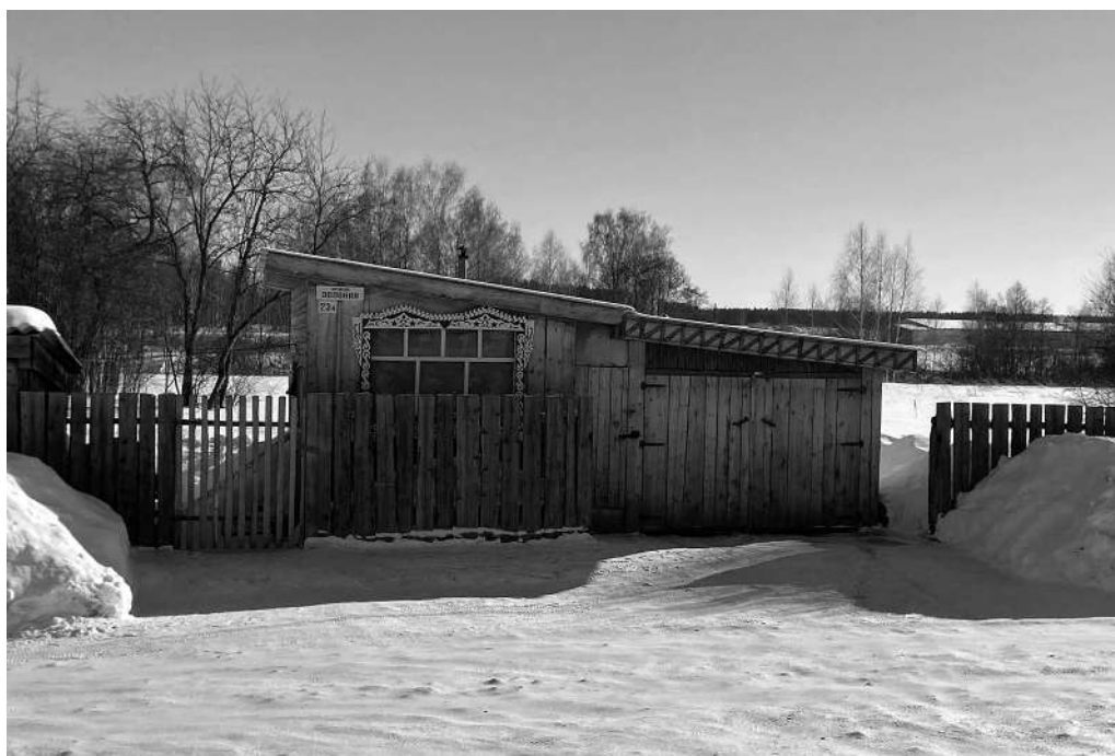
Photo 2. The single room where the healer Zina receives her visitors. Photo by the author, 2021.