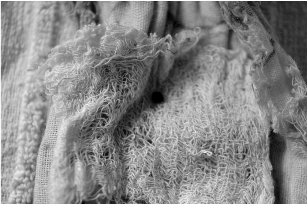
Photo 8. The kidney stone used in magic healing.