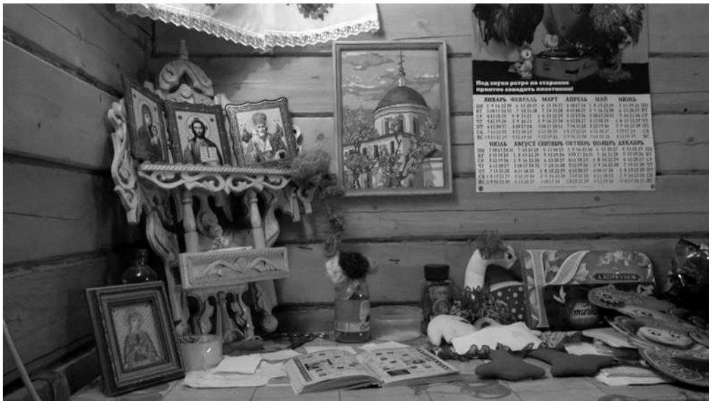
Photo 6. The iconostasis and gifts of the healer Nadezhda.