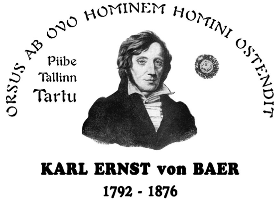
Figure 1. Karl Ernst von Baer Memorial Medal