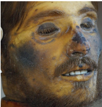
Figure 9. Details of Giagoulas' head.