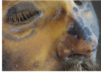
Figure 12. Signs of decay among the facial wrinkles.

The assessment of the current conservation status was based on macroscopic observation and comparison between the recent and the older photographs of Giagoulas' head. The intense smell of decay, the absence of a very recent microbial study in the museum and also poor lighting of the museum did not allow an overall photographic documentation or recording. Moreover, moving the head or exposing it to the museum's atmosphere would be too risky because of the poor conservation state.