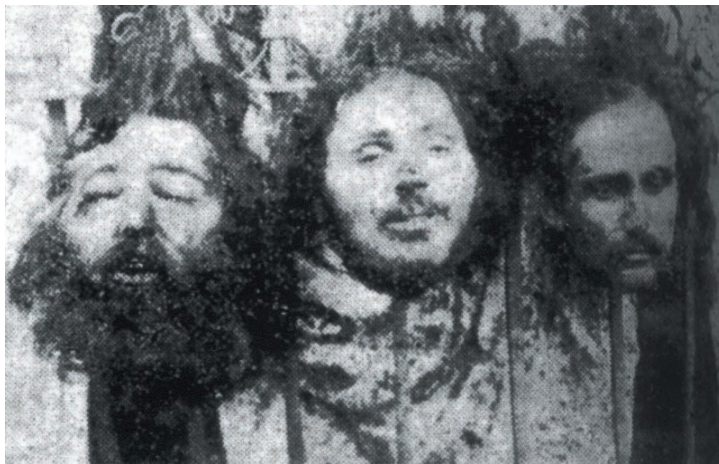
Figure 3. The decapitated heads of the Giagoulas' gang with the head of Fotios Giagoulas in the centre.

Since 1925, no further research has been conducted on the decapitated heads. Museum records show that the heads were moved on several occasions between 1925 and 1992. During this time, they were stored in cardboard boxes, prior to their display in the museum as permanent exhibits.