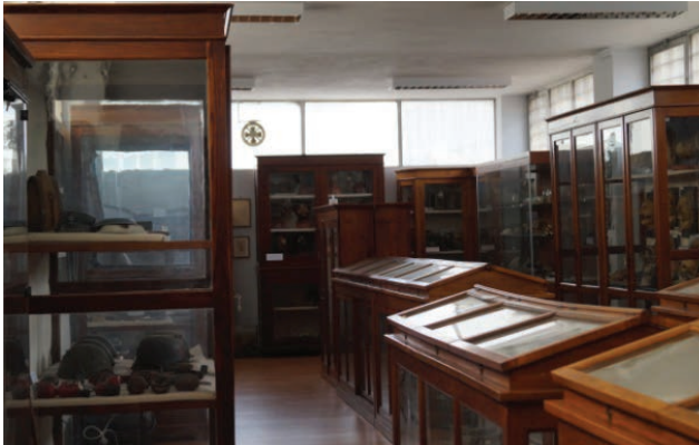
Figure 4a. The inside Museum of Criminology.