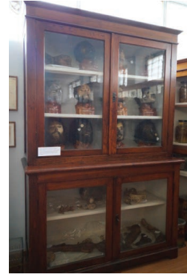
Figure 4b. The display case with the mummified heads.