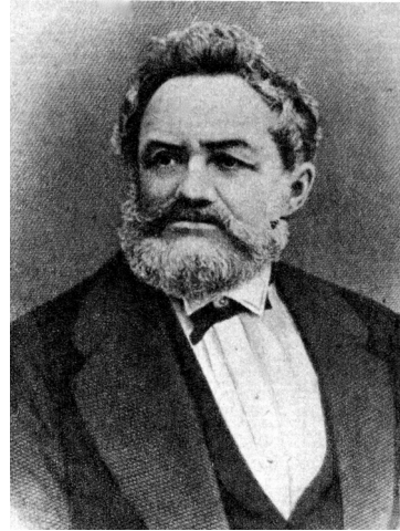
Academician Alexander von Middendorff.